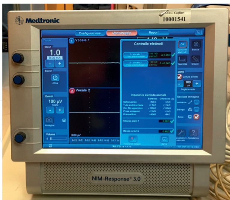
Figure 4. Check of the impedance value of the electrodes from the monitor.

tests to verify the correct location of the ET tube include the evaluation of respiratory changes or a further laryngoscopy. About the first method, in the short-term window period between the loss of the effect of short-acting NMBA and the deepening of anesthesia following intubation, spontaneous respiratory movements should result in waveforms with an amplitude of 30–70 \mu\text{V} on the monitor. These respiratory changes should be detected for both vocal cords.