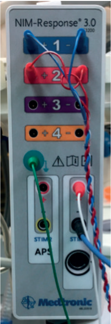
Figure 3. Stimulation and recording sides are combined on the interconnect box, through which they connect to the monitor.

recording side, instead, consists of the ET tube with surface electrodes, which are placed at the level of the vocal cord, and their ground electrode ( Figure 2 ). These two main systems combine on the interconnection box ( Figure 3 ), through which