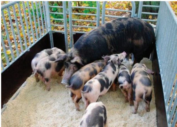
Figure 2. Lietuvos vietinė sow with piglets.