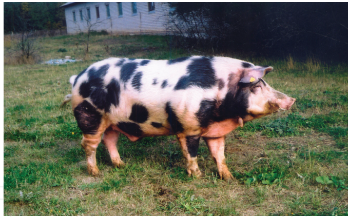
Figure 3. Lietuvos vietinė boar.

black spots on the body, but colour variations include black and white, ginger, black and tricoloured ( Figures 2 and 3 ). They have a friendly temperament. Being insensitive to the sun, these pigs are suitable for grazing.