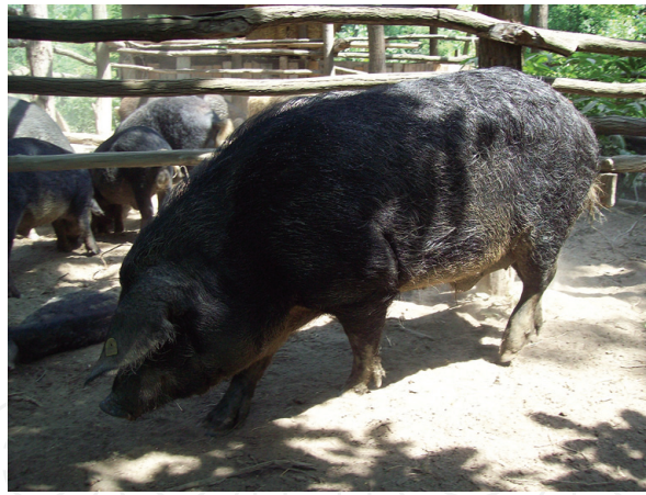
Figure 3. Mangalitsa boar.