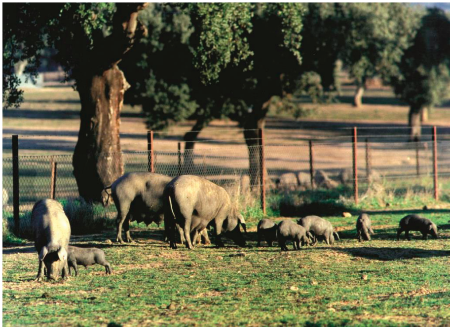
Figure 2. Iberian sow with piglets.