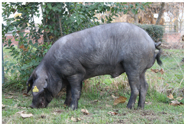
Figure 3. Iberian boar.

lampiño varieties). The legs are thin and resistant, and the hooves are dark and uniformly coloured ( Figures 2 and 3 ), except for the variety Torbiscal which can present depigmented or whitish-striped legs.