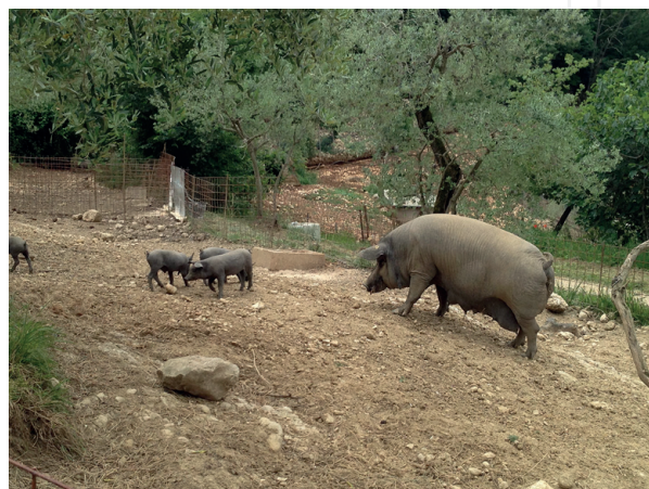
Figure 2. Casertana sow with piglets.

Casertana breed is raised in different Italian regions: Campania, Molise, Lazio and Umbria [3]. The traditional breeding technique foresees a wide use of grazing in beech, chestnut or oak woods, with poor feed integration and with large spaces where the Casertana pig can freely graze [5]. Currently, most of the animals are fattened according to modern breeding techniques, with the use of protein nuclei and integrated feed even if breeding with extensive and semi-extensive management is still present, usually in the oaks. When animals are intensively raised, they are kept continuously confined with basic heat protections available even if the environment is not completely climate controlled.