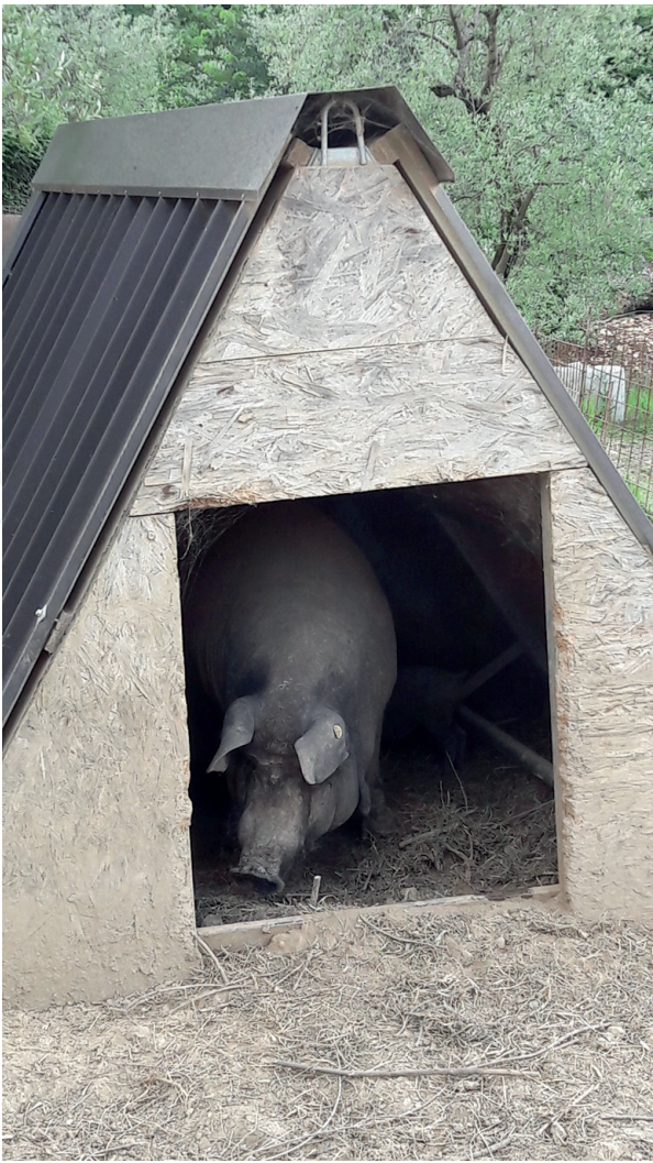
Figure 3. Casertana boar.