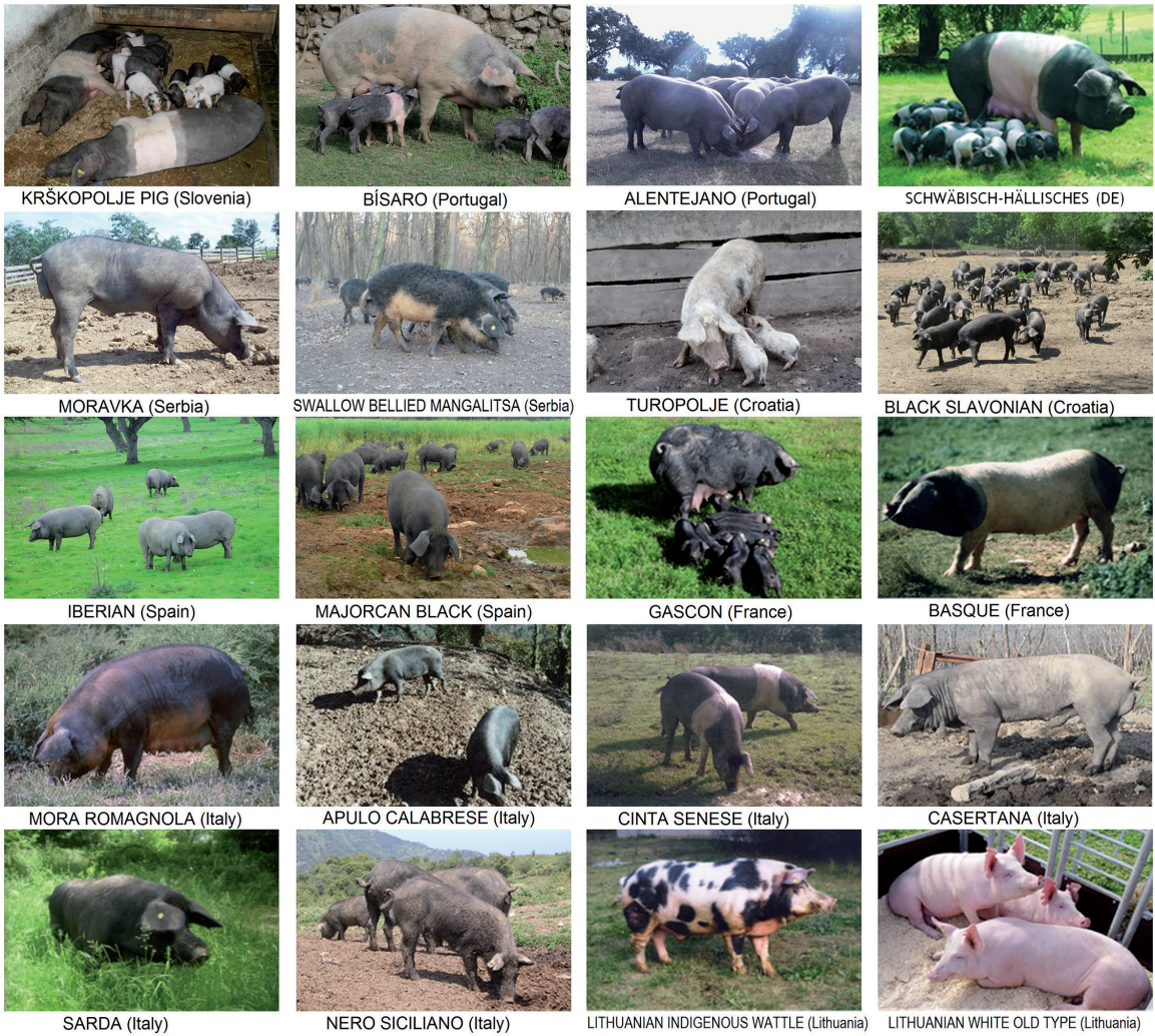
Figure 1. Local pig breeds studied in the project TREASURE.

In order to improve the supply and their market potential, it is essential to acquire more scientifically based knowledge about their genetic singularity and adaptive capacity, to evaluate different management practices, their nutritional requirements and use of local feeding resources, the impact on environment, and to evaluate their socio-economic merit.