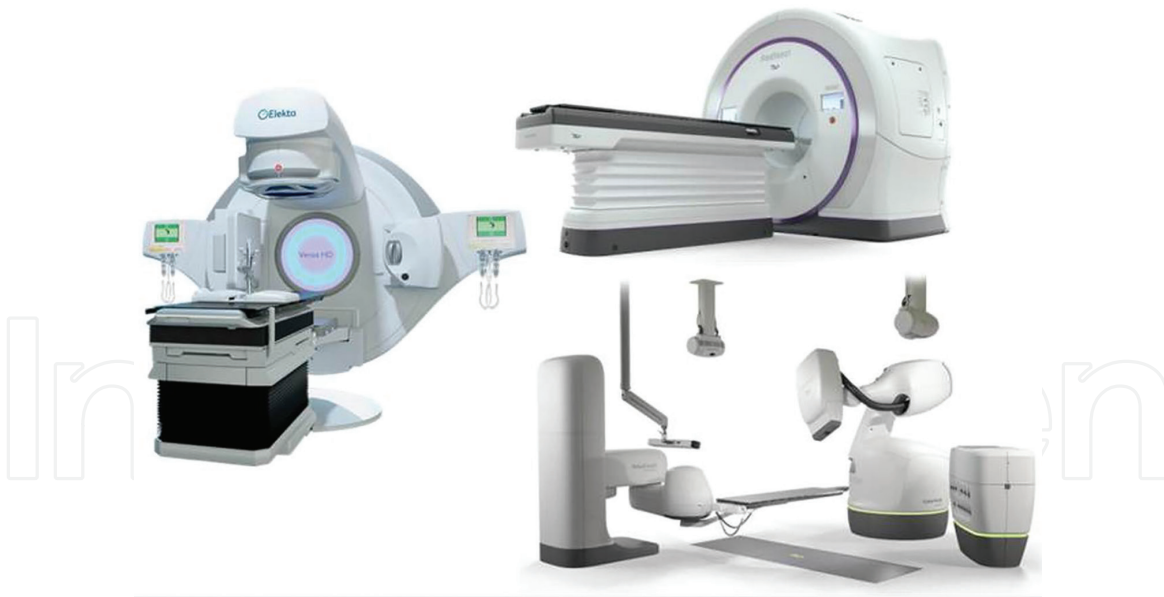
Figure 1. Commercial treatment delivery units. From left to right are versa HD (Elekta AB), Radixact (Accuray Inc.), and CyberKnife M6 (Accuray Inc.).