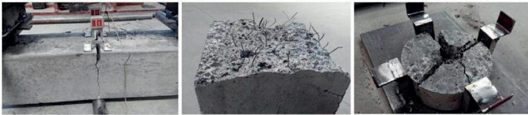
Figure 2. The application of EAF slag concrete in pavements [7].