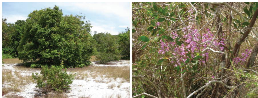
Figure 2. Natural vegetation on dry part (ridge) of BRIS soil ecosystem on Terengganu coast with a clumping pattern of vegetation (left image) and wild orchid species, Phalaenopsis pulcherrima , thriving well underneath vegetation clump (right image).

The ridge areas on the dune which are dryer due to its loose sandy structure surprisingly support quite a number of adapted coastal vegetation [25], including more than 30 species of wild orchids [40] ( Figure 2 ). Thus, the Terengganu coastal plain could be an important gene bank for wild orchids that could support commercial orchid industry, one of the option values under the total economic valuation (TEV) [5]. The aesthetic value of this coastal ecosystem together with its natural flora, fauna and landscapes could potentially be conserved and highlighted as one of the many ecotourism products for Terengganu to add to the economic benefit to the coastal communities. This value could be a monetary trade-off for conserving Terengganu BRIS ecosystem. With all the outlined ecological values, services and potentials, gelam forest is no doubt a valuable premise for Terengganu's coastal ecosystem resilience. Maintaining healthy Gelam forests will help maintain their ecological services for the benefit of the coastal environment that supports the livelihoods of coastal communities. Rather than being seen as unproductive and unimportant, gelam forest should be conserved for their values and services. Awareness on the importance of gelam forests to the sustainability of coastal ecosystem and people should be intensified. Factors contributing to the risk faced by the Gelam forest are outlined in the next section.