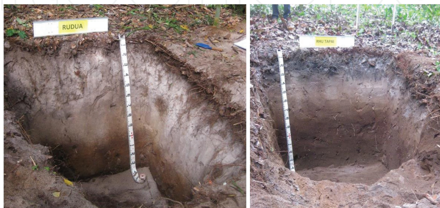
Figure 1. Examples of typical soil series (Rudua and Rhu Tapai soil series) under beach ridges interspersed with swales (BRIS) system in the East Coast of Peninsular Malaysia compose more than 90% of sand.