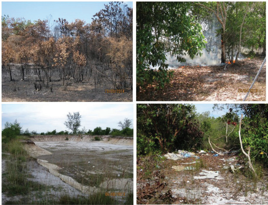
Figure 3. Threats to coastal ecosystem of Terengganu, frequent fire occurrence particularly during drought or non-monsoon months (top row images), illegal sand mining (bottom row, left image) and illegal dumping (bottom row, right image).

BRIS soil vegetation can easily catch fire, particularly in non-monsoon months or drought season ( Figure 3 ) which can be of natural process and human induced. High incidence of sunray and high temperature of sandy soil surface may initiate fire naturally. Fire can also occur simply from human reckless behaviour, for example, by throwing cigarette butts into the dry and sparse vegetation on BRIS soil ecosystem. There was an extensive fire occurrence recorded along Terengganu coast [41] and several places along coastal road in Setiu experiencing fire in 2016, coinciding with low rainfall and drought in 2014–2016 [30]. Fire is one of driven factors for ecological succession [42] and sometimes needed for vegetation regeneration [43]. However, with the presence of fire-adapted species, ecosystem resilience is negatively affected [44]. This brings us to the next threat faced by Terengganu