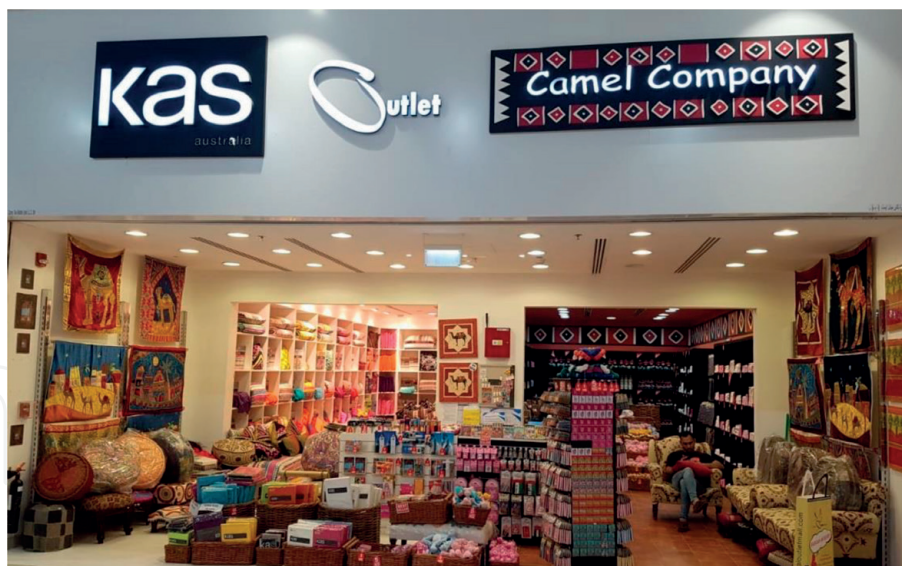
Figure 3. Camel milk based products in Australia.

Australia (Australia). Large camel farms are being established, and increased funding for camel research is noticed. Moreover, a wide variety of camel milk-derived products are now available in the market, including various new dairy products, such as pasteurized milk, fermented milk, flavored milk, butter, cheese, and milk tea [37, 38]. As a specific example, Bactrian camel milk is used for making cheese, butter, and yogurt in Mongolia [13]. Traditional fermented camel milk is produced and consumed in several countries, such as, Shubat (Turkey, Kazakhstan, and Turkmenistan), Suusac (Eastern Africa, Kenya, and Somalia), and Garis (Sudan and Somalia). Despite the effort made by researchers to produce yogurt from camel milk, the manufacturing of this by-product needs more study due to the fact that camel milk does not easily coagulate [39]. In Dubai, a coffee shop business specializing in different hot and cold drinks and pastries made with fresh camel milk called “Cafe2go” was set up recently. Since 2011, it has expanded successfully to 10 locations in Dubai and Pakistan and is soon to be opened in Oman and Saudi Arabia. Furthermore, camel milk utilization is not limited anymore to the producer region only, but it is now marketed overseas also. It has recently been exported from the United Arab Emirates to the European Union [40]. Furthermore, recent studies have investigated the optimization of fermentation processes [41] and cheese-production from camel milk [42].