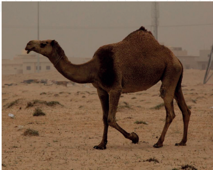
Figure 1. Dromedary camel.

by the Bedouins (people who inhabited the desert) where access to green vegetables and fruits is limited, thus providing, in that case, a significant nutritional relevance. Although camel milk is linked to the culture identity of Bedouins for a long time, small-scale and large-scale farms for intensive production of camel milk have been implemented worldwide only in recent years. The establishment of these farming systems was synchronized with the increased consumer's interest in unprocessed raw non-bovine milk consumption. While cow milk represents 82% of the total quantity of milk produced in the world, non-bovine dairy species provided 133 million tons in 2016 [1]. Camel is considered one of the most important dairy animals contributing to about 0.3% of the milk produced in the world [1] ( Figure 2 ). Raw camel milk has