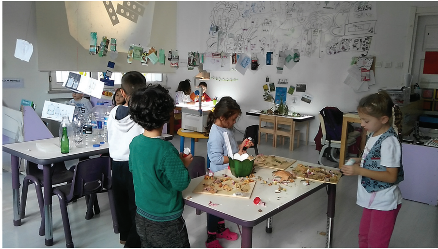
Figure 1. Altın Çağ Reggio Emilia-inspired preschool.

This chapter aims to show how teachers can help preschoolers happily construct their knowledge and meet standards successfully in their Reggio Emilia-inspired preschools. More specifically, it focuses on three aspects of science education in early childhood, namely, (1) the way Reggio Emilia teachers accomplish the early childhood science content and science process skills that children need to acquire at early ages, (2) the philosophy of teaching and learning science in Reggio Emilia preschools—integrated teaching and learning and 3H principle—and (3) the 80 Project. This chapter discusses integrated teaching and learning philosophy and 3H principle of early childhood education, namely, hands-on, heads-on (minds-on), and hearts-on education, because in Reggio Emilia classrooms, children are seen as a whole with their hands, minds, and hearts and education needs to satisfy all. Moreover, this chapter presents some examples and photos of science experiences happened within the project named “80” in Reggio Emilia-inspired Altın Çağ preschools in Turkey so that the teachers can easily comprehend how to get children to work on science projects from the first stage of development of a project to the last one. “80” is a child-sized doll made with craft paper by the preschoolers. The 80 Project presents the journey of the preschoolers who looked for ways to recover 80.