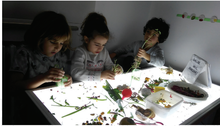
Figure 5. Examining, drawing, and experimenting with plants.

because they could not color the drug dough as they wished. Then, they decided to add acrylic color to the drug dough (Figure 5).