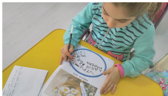
Figure 6. Writing "daisy is good for stomachache and insomnia."

The preschoolers used bottles and pipes to fill the basins. They were experimenting with the pipe system and trying to figure out which basin will be