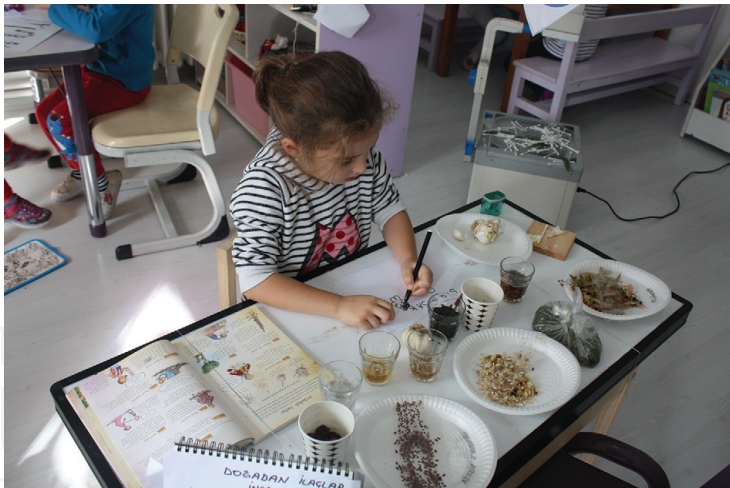
Figure 4. Examining, drawing, and experimenting with herbs.

She caught what the preschoolers were really interested in, namely, curing people by mixing stuff to make drugs, and set up the physical environment accordingly.