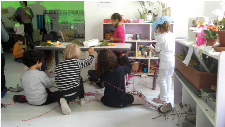
Figure 3. Weaving the table with tiny ropes to create a quarantine room at the hospital.

room. With the help of enriched physical environment and materials, the preschoolers started working on more in-depth inquiry questions ( Figure 3 ).