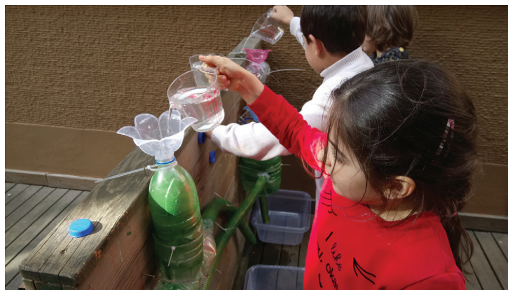
Figure 8. Drug factory: pipe system and solving math problems.

filled first with the mixture they made from a cabbage. They were so excited to solve that problem ( Figure 8 ).