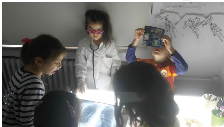
Figure 2. Preschoolers are experiencing medical materials.

The preschoolers continued to work in the classroom by using newly added materials and make visits to the playground and outside the school. They started investigating medical materials and making a special place for patients. They used tiny ropes to weave and cover a table. They said that nobody except patients and doctors can enter this place and then patients are not allowed to exit this place and even touch the ropes. The teacher said that it is like a quarantine room at hospitals, and patients, who might have an infectious disease, are not allowed to leave the