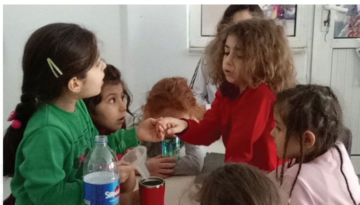
Figure 9. Learning community is negotiating and discussing the 80 Project.