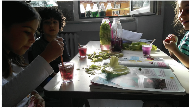
Figure 7. Drug making with cabbage and colored water.