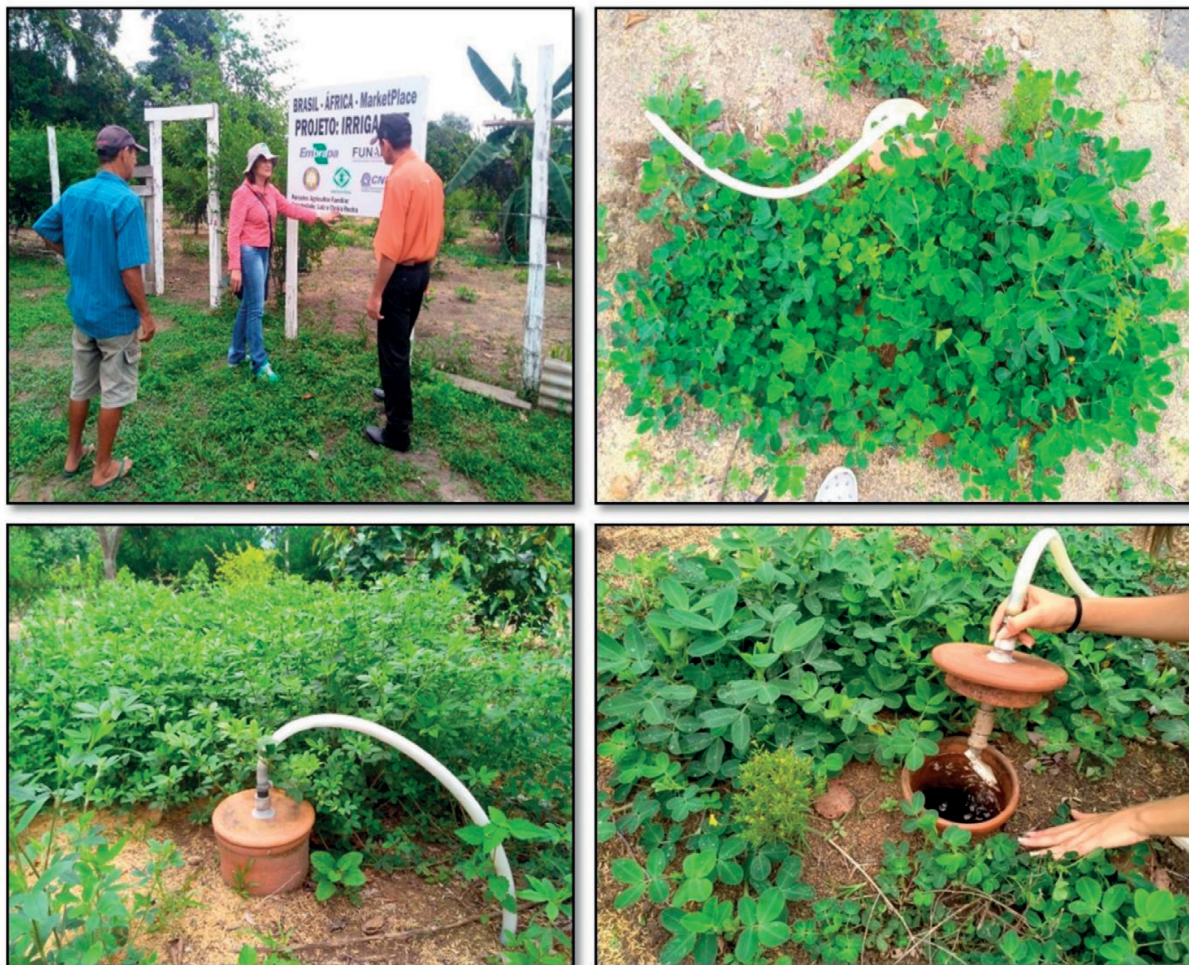
Figure 2. Images showing the experiments installed in the Amazon sharing knowledge obtained from the Brazil partnership.