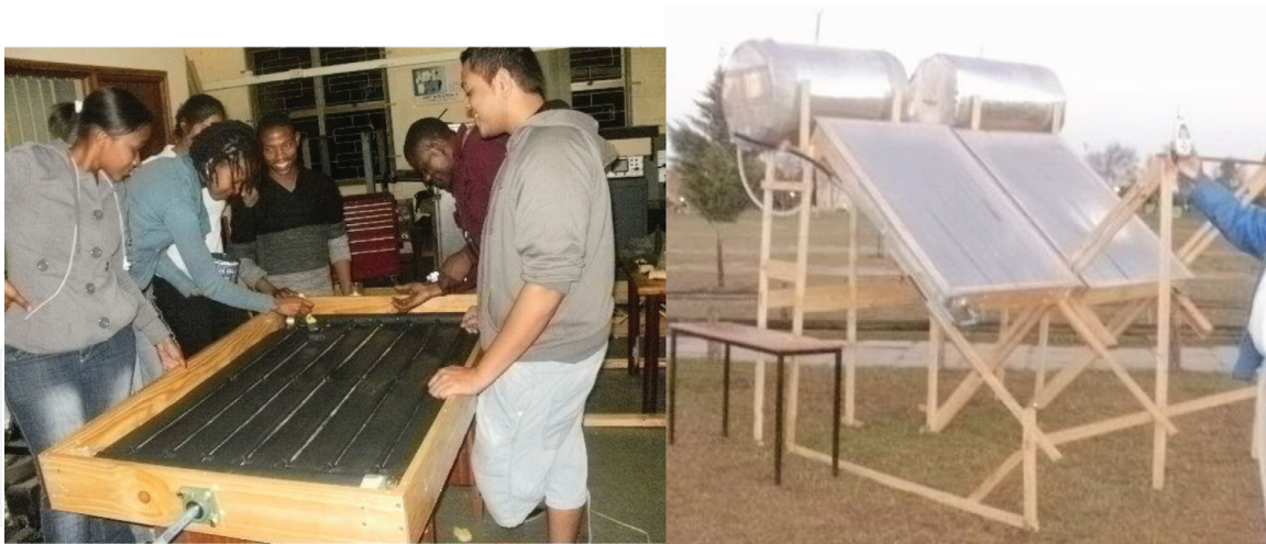
Figure 2. Students in the workshop and their finished products in the Mech. Eng. Dept. compound.