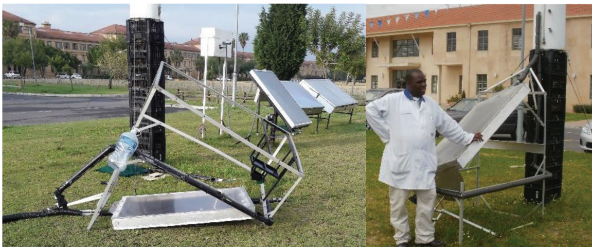
Figure 3. The blown-over solar collector (left) and the author inspecting the repaired system (right).

Machine Design students requested to repair the installation as their semester project. They were assigned the repair project, but with additional instructions to consider whether, in light of longer term weather data, available at the department's weather station, it was necessary to re-examine the designs of both systems. Additionally, they were to cost their repair work, including their labour at assigned hourly rates. They successfully repaired the system, as in the second part of Figure 3 . Costing was correctly done and useful observations on the installations were made.