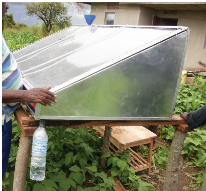
Figure 5. One of the new solar water purifier designs deployed in Uganda for consumer trials.