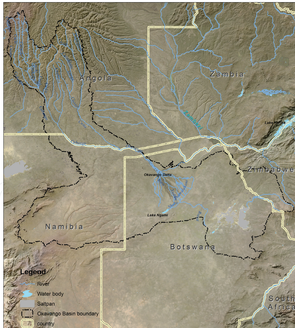
Figure 1. The Okavango River Basin (ORB).

According to Wolski et al. [12], the ORB is composed of an upper part (in Angola) characterised by a typical river catchment and a lower terminal part (in Botswana) consisting of the Okavango Delta and terminal rivers, where the "water's ultimate sink is evaporation to the atmosphere". The ORB has four catchment areas, which the Angolan headwaters (in Angola), the middle reaches (in Namibia) and the Botswana portion, which consists of the panhandle and the delta ([10, 17], Figure 1). This system is drained by the Okavango River, which is one of the largest rivers in Africa [13]. Because of its location in an arid area, the Okavango River is a major source of water in the region [13].