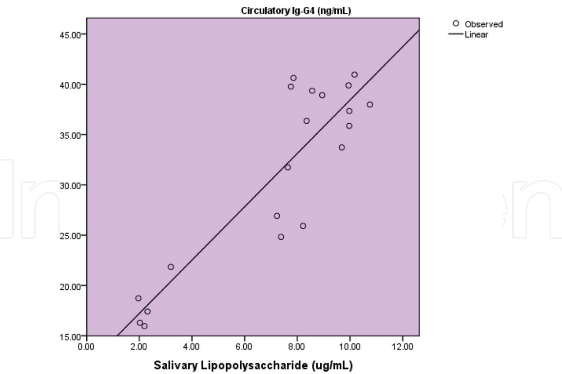
Figure 2. Correlation between salivary lipopolysaccharide of Porphyromonas gingivalis concentration and circulatory Immunoglobulin-G 4 level. Very strong correlation between salivary lipopolysaccharide and Ig-G 4 had been observed ( r^2 = 0.796 ; p < 0.001 , n = 20 ).