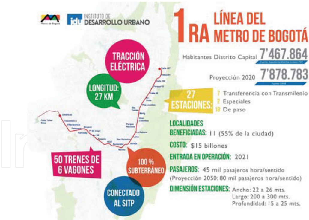
Figure 3. First subway line in Bogotá 2012 [5].

The Metro proposed by Enrique Peñalosa is cheaper and faster to build because it just requires adequation and rehabilitation of the public space around the stations. It does not need a recollection water system, the investment on other systems of the infrastructure like