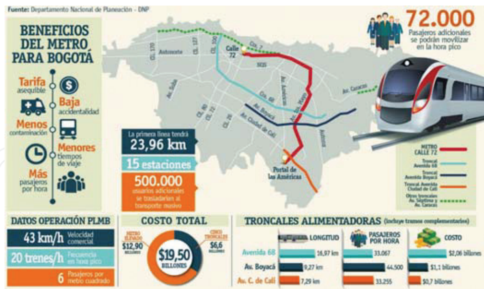
Figure 4. Bogotá Metro 2016. Bogotá Subway 2016. ( http://www.vanguardia.com/politica/410725-la-nacion-solo-aportara-909-billones-para-el-metro-de-bogota ). Image that shows that the line is shorter and there is only connectivity of the Metro with the lines of TransMilenio projected to be developed also in the current period of government.

energy, expansion of the aqueduct and sewerage networks, the participation of the people, nor plans to integrate city systems and the city with the towns around the first ring. The model proposed in a private-public association consists in creating the financial conditions to build the Metro, which is going to be financed by the private recourses, allowing these investors to grow in altitude their buildings, choosing the best locations and getting the benefits of the greatest value involved in the urban interventions.