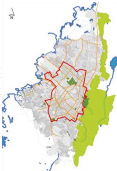
Figure 1. Delimitation of the extended center of the city [2].

According with the City Plan 2 in Gustavo Petro period of government, the revitalization of the expanded center strategy included actions such as the updating and expansion of the aqueduct and sewerage networks; the construction of conduction, drainage, and water reuse systems; the generation of green public spaces that make visible and generate new urban meanings around water; the promotion of densification processes through integrated urban projects; and the use of greater buildings and uses to finance urban redevelopment through low-cost housing projects and high-quality construction and space, strengthening the role of the communities to recognize and reconstruct the territory based on the promotion of creative practices, the enjoyment of cultural diversity, and the care of the environment.