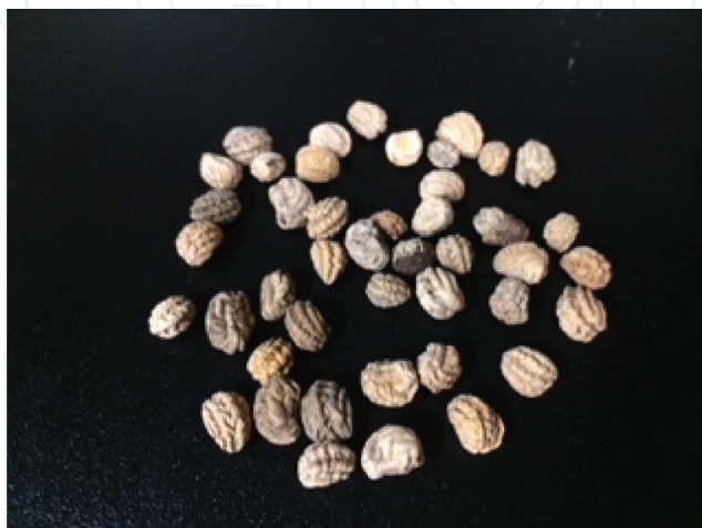
Figure 1. Image of seeds of Hibiscus mutabilis .

The ground fractions of Hibiscus mutabilis seeds were placed in a filter paper (Whatman No. 42) and introduced in a cartridge and they were extracted in a Soxhlet extractor (Southern Labware, Inc., Cumming, GA, USA) using hexane at 65–70°C during approximately 5 h, the time necessary to extract most of the oil from the seeds. The solvent was then evaporated by a vacuum dryer (Columbia International Tech, Irmo, SC, USA), and the oil yield was 9.0 g from 100 g of seeds. The extracted Hibiscus mutabilis seed oil was transferred into glass tubes, centrifuged at 12,000 \times g for 30 min at room temperature, and then stored at 4°C in the dark until analyses. This oil is referred to as the natural Hibiscus mutabilis seed oil ( Table 1 ). The natural Hibiscus mutabilis seed oil was subjected to chromatography to remove naturally occurring antioxidants such as tocopherols and carotenoids [22]. Thus, this