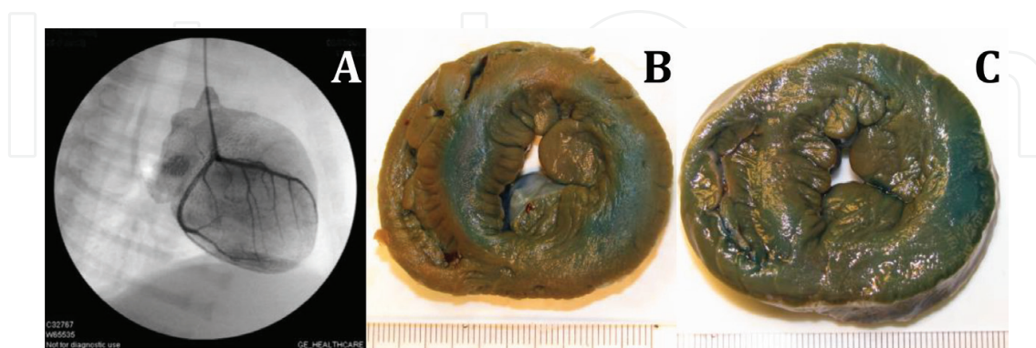
Figure 3. Preclinical evaluation of intracoronary vector administration in large animals, for instance Beagle dogs. Similar amounts of cDNA were formulated differently. (A) Sample of a coronary contrast injection of the left main coronary artery in a dog heart highlighting the route of administration. (B) Mid-ventricular cross-section after AAV1 vectorization of a lacZ coding cDNA. (C) Mid-ventricular cross-section after polymer P85 vectorization of a lacZ coding cDNA. X-gal staining reveals lacZ gene expression (unpublished results).

With regards to the first step to translate in vivo gene transfer into clinically relevant gene therapy and based at least partly on the use of naked DNA, physical methods like direct intra-myocardial injections have demonstrated feasibility, but also limited efficiency. Derived from these pioneering steps, several refinements have been introduced over time. In the context of rhythm control, one should look with interest to techniques like gene painting [72]. Gene painting refers basically to an innovative technique aimed at a very