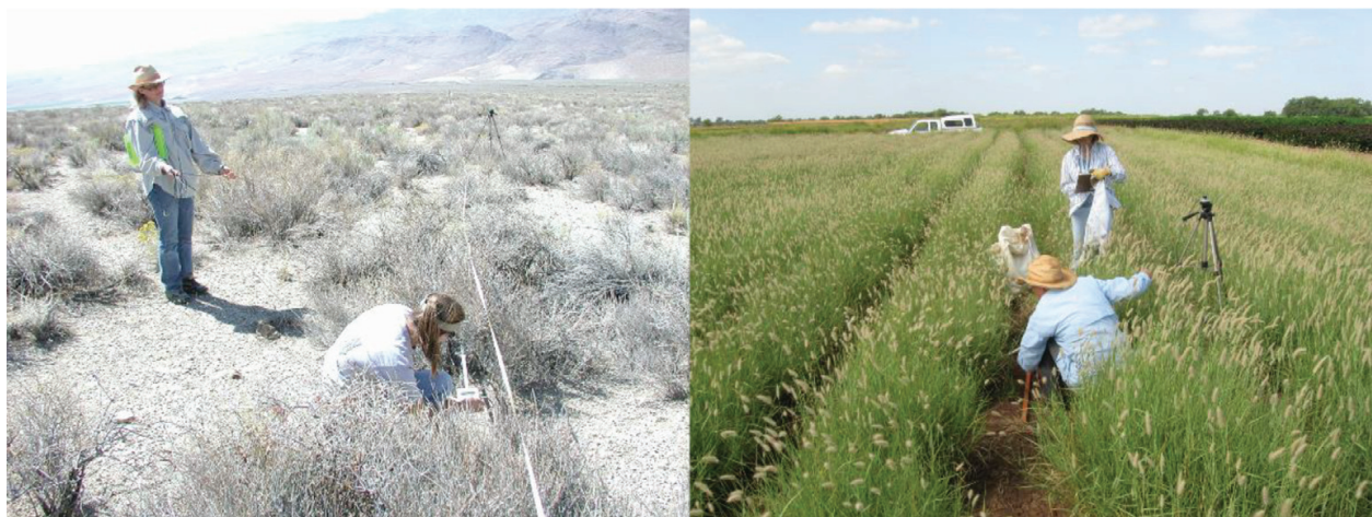
Figure 3. Intercepted photosynthetically active radiation (IPAR) measurements using an AccuPAR LP-80 Ceptometer at Bishop, California, and Bryan, Texas.

Field-derived values for the critical species-specific parameters have been described previously [17–21]. The model simulates light interception by the leaf canopy with Beer's law [16]