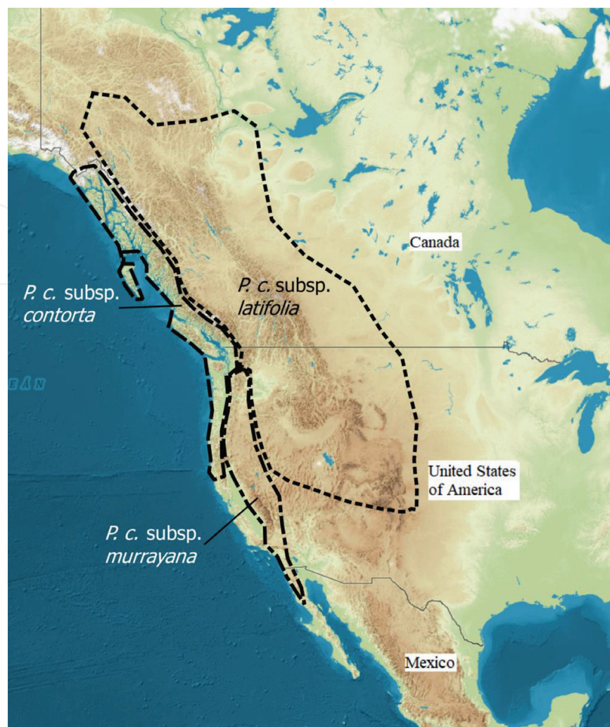
Figure 1. Distribution area of three Pinus contorta subspecies according to the U.S. Geological Survey [6]; map background source: https://www.seznam.cz/ .

and in the US in South Dakota (Black Hills). The range of P. c. subsp. murrayana reaches from the Cascades of southern Washington State and Oregon (Cascade Range) across the Sierra Nevada and Transverse Ranges in California to Baja California and Sierra de San Pedro Mártir in Mexico [5].