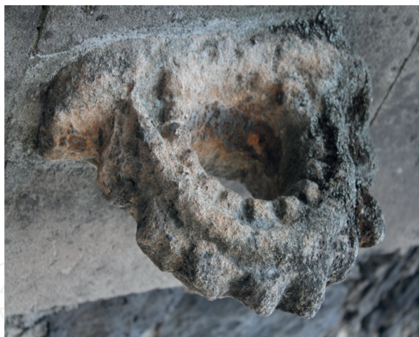
Figure 1. Biodeterioration on stone.

Cyanobacteria and algae such as chlorophytes, chrysophytes, and diatoms are a morphologically diverse and widely distributed group endowed with remarkable adaptability to variable environmental conditions and effective protection mechanisms against various abiotic stresses that enable them to colonize almost all classes of extreme lithic habitats [24]. These microorganisms form pigmented scabs (patinas) and incrustations that affect the substrate esthetically and cause physical and chemical deterioration of the rock. The epilithic cyanobacteria play an important role in the dissolution of the limestone carbonate, being able to cause the detachment of parts of it, due to a decrease in the coherence of the crystals around the colonies [25, 26].