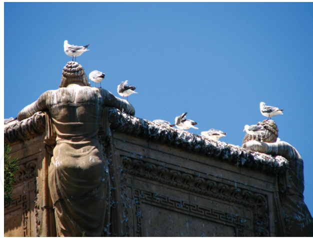
Figure 1. Gulls excrements blemish and destroy buildings and monuments [1].