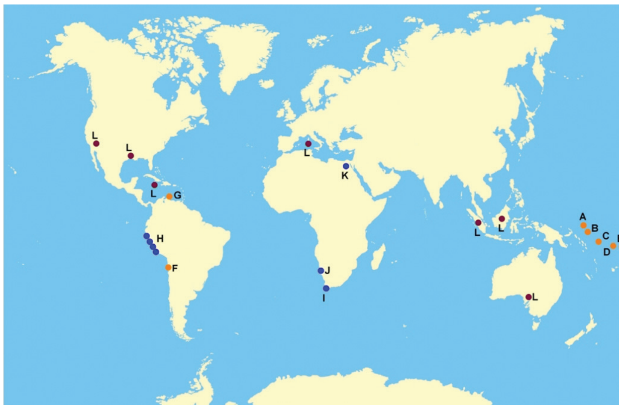
Figure 5. Important deposits of phosphate Guanos (A-G), nitrogen Guanos (H-K) and bat Guanos (L).

conditions for the growth of coral reefs are given, which represent the calcareous substrate for the formation of phosphate Guanoses.