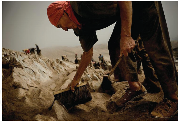
Figure 9. Guano extraction on the Peruvian island Guañape Norte.

The Guano extraction always takes place after the same dismantling steps. First, the raw Guano is swept out of the rock crevices or scraped together ( Figure 9 ). Hard-baked Guano is loosened with pickaxes.