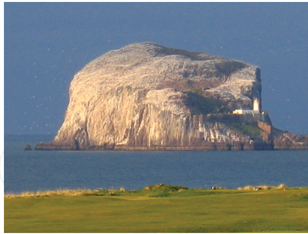
Figure 3. Like the island “Crab Key” in Ian Flemmings famous novel “Dr. No” Bass Rock in the Firth of Forth (56.0769°N 2.6410°W) is covered with white Guano produced by 150,000 gannets plus guillemots, razorbills, cormorants, puffins, eider ducks and numerous gulls.

so-called “bat Guanoses”, which are occasionally found in large caves, especially in Asia and the Caribbean and used locally or are rarely traded as fertilizer. In this chapter the term “Guano” always refers to Guano deriving from seabirds. The writer Victor von Scheffel (1854) once wrote a hymn giving a poetic description on the genesis of Guano [7].