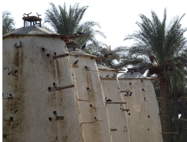
Figure 2. Pigeon houses at SEKEM farm in Belbeis near Cairo deliver birds dung as essential fertilizer for small scale farming.

balance of non-agrarian ecosystems [3] and an essential source of plant nutrients in many smallholder farming systems in developing countries, like for instance Egypt [4] ( Figure 2 ).