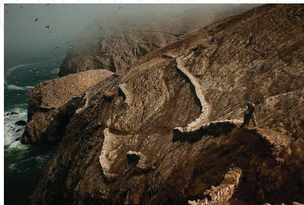
Figure 10. Century-old isohypses-parallel stone walls for protection against ragging of the raw Guano.

The overburden remaining on the gratings is dumped into the sea. The powdered sieved end product is shoveled into white plastic bags of 50 kg capacity printed with Probonas emblem. Since no heavy equipment can be used for transport on the Guanofelsen to protect the environment, the entire transport of the bags is also carried out by physical force. For loading, the sacks are usually transported to the edge of the cliffs and then transferred to ships with a simple cable pull ( Figure 12 ).