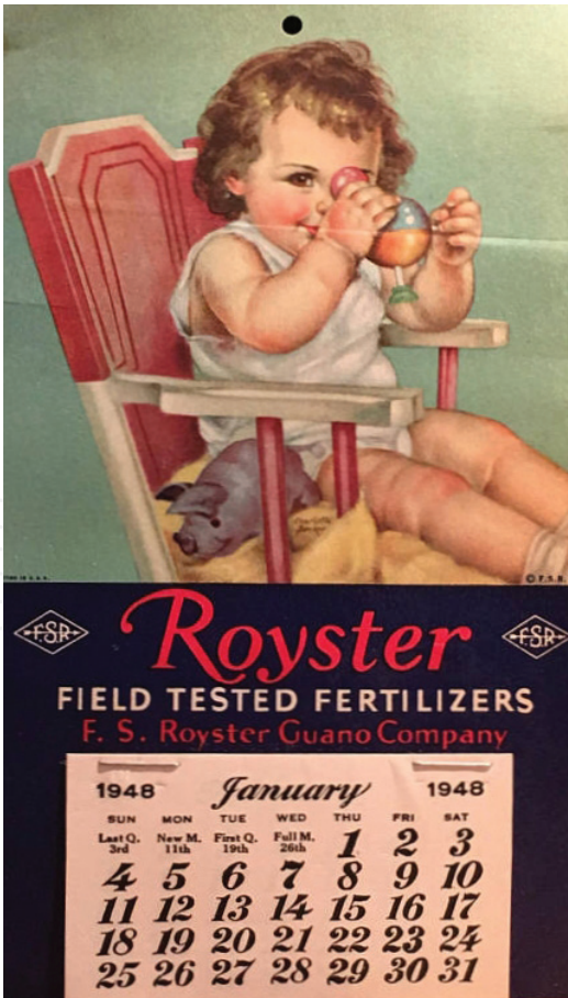
Figure 4. Fertilizer manufacturers rendered the apatitic phosphates in Guano soluble by treating with sulfuric acid. 1948 calendar sheet from the Royster fertilizer company.

Guanós with high nitrogen content are simply called “nitrogen Guanós.” They contain nitrogen in the single-digit to low double-digit percentage. However, in raw Guanós classified as