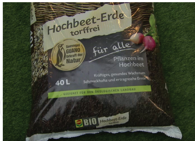
Figure 8. The Guano logo provides commodities with a glorious nimbus [42, 43].

The project “Proabonos” promotes ecologically compatible Guano mining and targeted Guano marketing at preferential prices to small farmers and indigenous peasant communities. These measures should contribute to a sustainable increase in agricultural yields as a contribution to overcoming poverty, taking into account ecological considerations. From 1986 to 2007, the state-owned Proabonos fertilizer Company harvested 342,637 t of Guano. Almost the same amount was harvested in Peru in 1861 within a year [29].