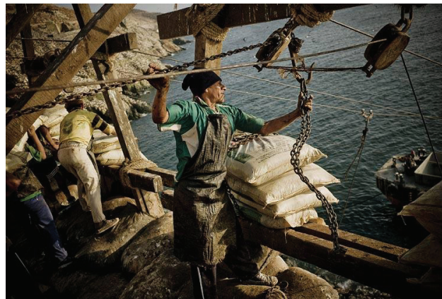
Figure 12. Loading the final product.

Each worker shoulders 125 sacks per day — this corresponds to a total weight of 6.25 t. In order to be able to sustain this extremely strenuous work in the long run, the different working positions are occupied in rotation. Due to extreme climatic conditions, working hours usually start at 4 am and end at 12 noon to avoid high temperatures in the afternoon of more than 35°C. The usual working rhythm is 3 months without rest days.