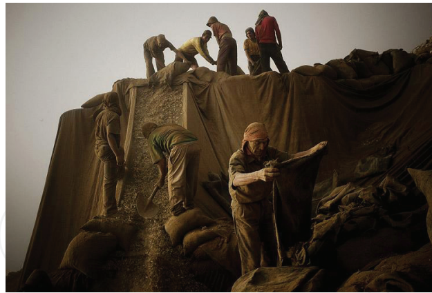
Figure 11. Sieving of the raw Guano.