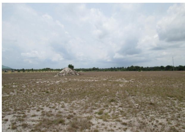
Figure 2. Dredged and sand filled mangrove forest in Buguma, Niger Delta, Nigeria. There are still some mangroves that can be seen at the foreground. On the left of the picture is the fence of a secondary school. No mangrove tree has ever grown in this area since the sand filling in 1984. The area is now occupied by weeds and other alien plant species.

are a variety of non-mangrove species in both the seaward and landward areas. The landward area has sandy soil that has large percentage growth of grass species such as corn vine ( Dalbergia ecastaphyllum ), coco plum ( Chrysobalanus icaco ) etc. Because of the proliferation of anthropogenic activities around mangrove forest some grass species had taken over the area. Examples of other species present include carpet grass ( Axonopus compressus ), elephant grass ( Pennisetum purpureum ), guinea grass ( Panicum maximum ), goose grass ( Eleusine indica ) and goat weed ( Ageratum conyzoides ). A major observation during field work is that mangroves when cut never grow back rather the area from where they are cut is over taken by weeds [28] which forms gradients around the wetland soil. Oil and gas exploration also affect species composition in mangrove forests [35]. For example, industrial activities had led to a permanent change in soil and species composition, which accelerates the proliferation of weeds and other alien species. The weed when they grow becomes the hiding place for foreign insects and rodent pest, which later invade the mangroves.