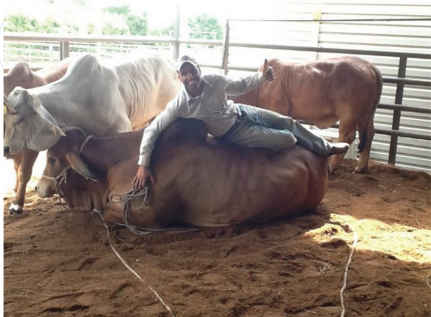
Figure 5. Confidence established.