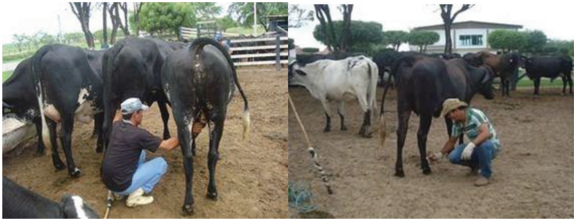
Figure 4. Desensitization of the udder and hind limbs.