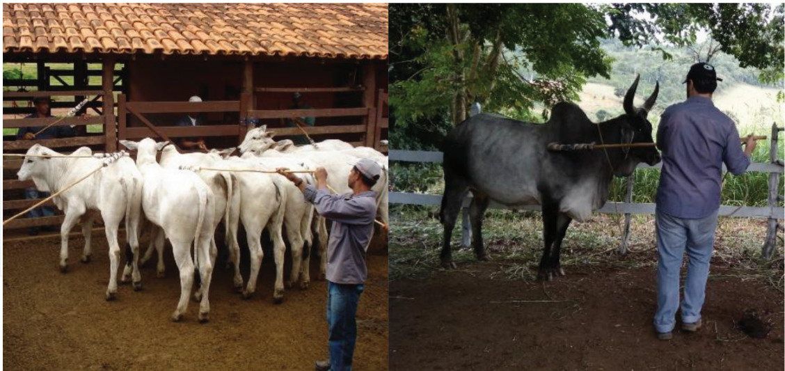
Figure 3. Reduction of flight zone and gradual approach during the process of natural taming using ropes and swabs.