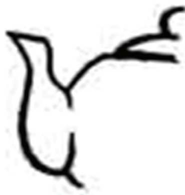
Figure 3. Teapot.