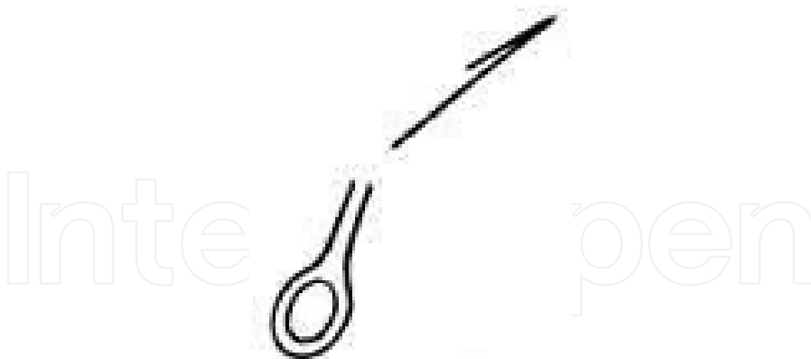
Figure 4. Scissors.

The investigation is individual and the answers are put in a separate protocol. Children look consistently at each of the stimuli and name it. All answers are noted regardless of their nature (correct or incorrect).