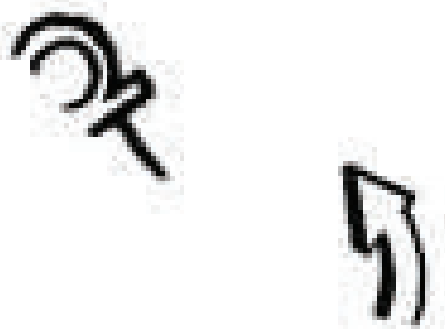
Figure 2. Anchor.