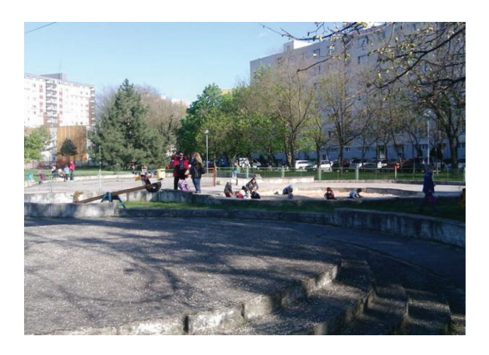
Figure 13. The original landscape architectural concept of the playground at the Gessayova Street in the Petržalka housing estate is still readable from the abstract geometrical forms of concrete platforms, which host new play elements.

Another characteristic feature of the children's playgrounds in the housing estates is that they become in many cases fenced (Figure 16). Sand and concrete are not used today, or are used very rarely. Nowadays, mostly rubber surfaces are used for the safety surfacing under play elements (Figure 17). In the cases of "natural" playgrounds, usually woodchips are used.