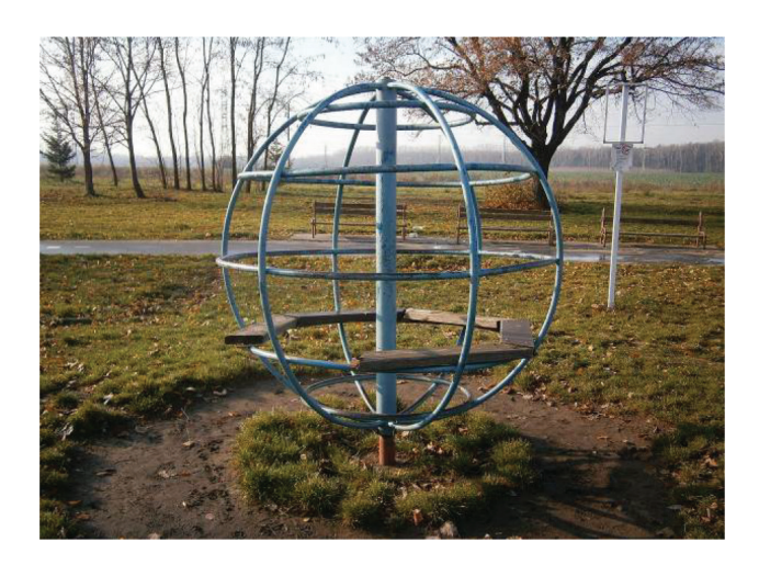
Figure 9. The popular playground element from the 1970s, called "Globe," was used as a climber and as a merry-goround—example from Trnava.

of the Aldo van Eyck's playground elements—the rectangular and round steel frames for climbing, or the latter like an igloo. Van Eyck's play equipment invited the child to actively explore the numerous action possibilities it provided. He paid special attention, for example, to estimating the proper distances between the bars in his climbing frames. Van Eyck intentionally created abstract play elements that do not have a single meaning and function, but rather they can be used in different ways and stimulate children's imagination [16–18].