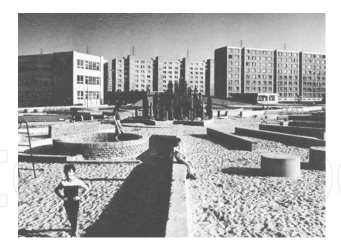
Figure 6. Sand area and play elements made of concrete in the playground of the housing estate Medzijarky in Bratislava.