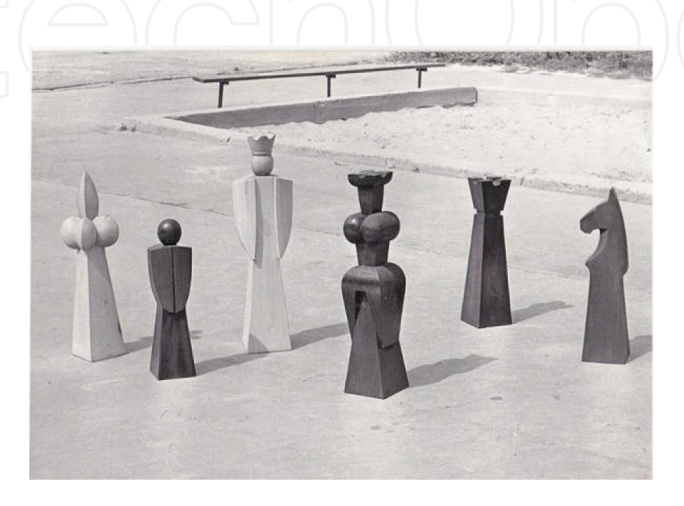
Figure 5. The wooden chess figures in the part of the playground designated for chess game.