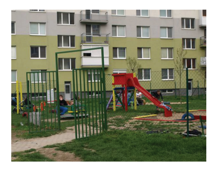
Figure 16. The example of fenced and gated playground with typified and standardized play equipment in the housing estate Veča in Šaľa.

Specific art-design play objects, designed as sculptures, have disappeared from today's play-grounds. The reason is that today, every new play element installed in the playground must meet the requirements of Slovak and European technical standards—STN EN 1176, which determines general safety requirements and test methods for playground equipment and surfacing, and STN EN 1177, which determines impact attenuating playground surfacing and critical fall height. The play elements installed in playgrounds must have either a certificate or declaration of conformity with the norm, what is a complicated process.