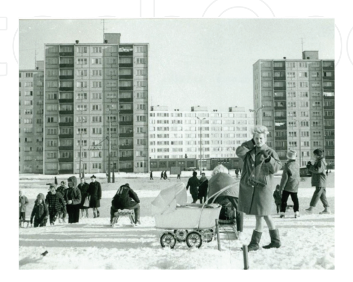
Figure 3. Green open space of the Terasa housing estate in winter, serving as winter playground.