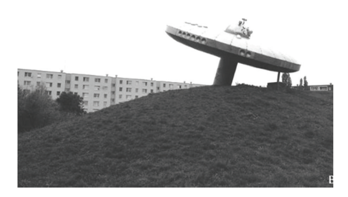
Figure 7. "UFO" as an art-design play element of the playground area, situated on the top of artificial hill, in the housing estate Medzijarky in Bratislava.

The landscape design of the courtyards included artificial hills, used in the winter for sledge riding and also a unique play element "flying saucer" - unidentified flying object or "UFO," made by sculptor Juraj Hovorka in 1979 (Figure 7).