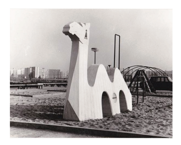
Figure 4. The concrete sculpture of camel in the sand play area was the most beloved play element of the playground.

The high-rise blocks of flats in the hosing estate Medzijarky in Bratislava, designed by architects Štefan Svetko and Štefan Ďurkovič in the 1970s of the twentieth century, have been arranged in the forms of big octagonal courtyards. This solution allowed to exclude the cars from the inner space of the courtyards and to create there green spaces as adventurous playgrounds with various playground elements (Figure 6).