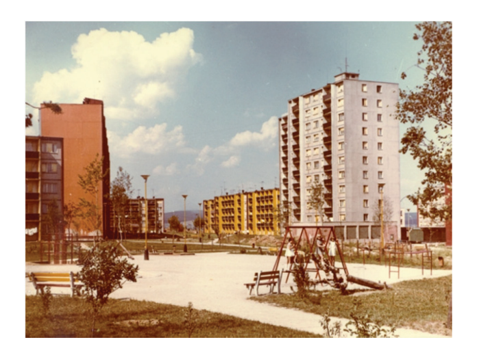
Figure 2. One part of the children's playground in the Kate's Park, in the Terasa housing estate, equipped with austere and simple elements—square window ladder climbers, slides, swings, and sand pits.

The concept of the playground complex Joy, in the Štrkovec housing estate in Bratislava, was set by landscape architect Alfonz Torma and the team of the municipal gardening company in the early 1970s of the twentieth century [15]. The complex included many attractions for