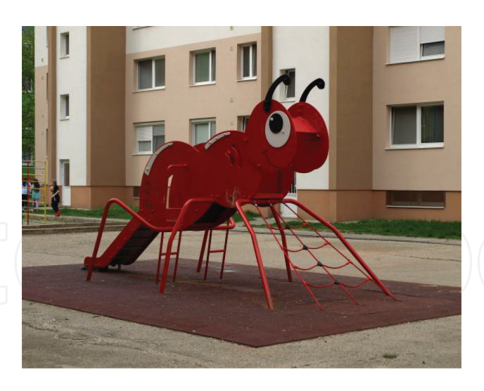
Figure 15. Some of the typified catalog play elements show individual design, play structure "Ant" situated in the courtyard of housing estate Veča in Šaľa.