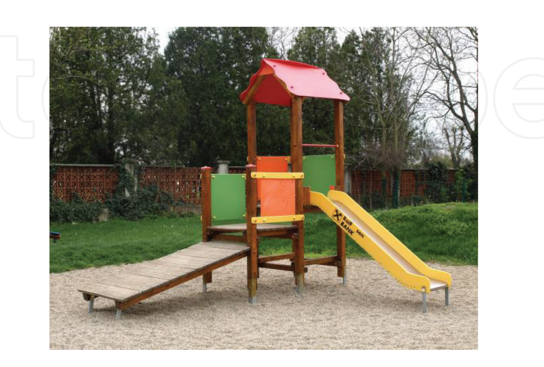
Figure 14. Typified and standardized play elements are mostly used in the playgrounds—the example from housing estate in Šaľa.