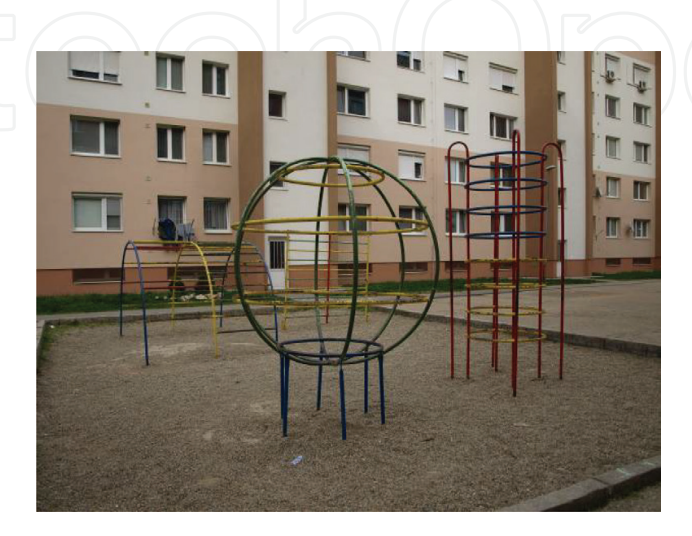
Figure 12. The preserved original steel play equipment, in front the "Globe" and the "Rocket," in the small play area in the housing estate in Šaľa.

Many of the former playgrounds which during the previous period fell into decay have been revitalized. However, only in few cases, the playgrounds have preserved their original design structure and the original play elements ( Figure 12 ). Today, the original steel playground elements, as for example the popular "Globe," do not fulfill the safety requirements according the current technical standards.