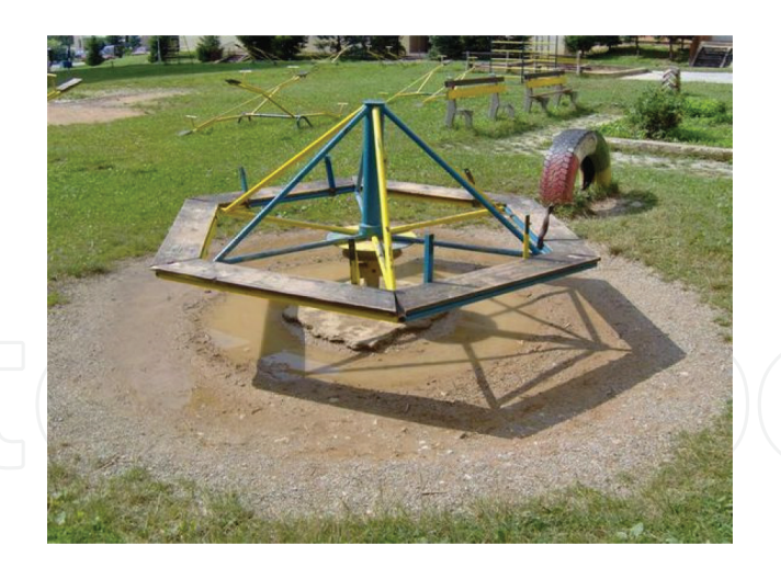
Figure 8. The typified merry-go-rounds from the 1970s are still found in the playgrounds—example from the housing estate Juh in Rožňava.