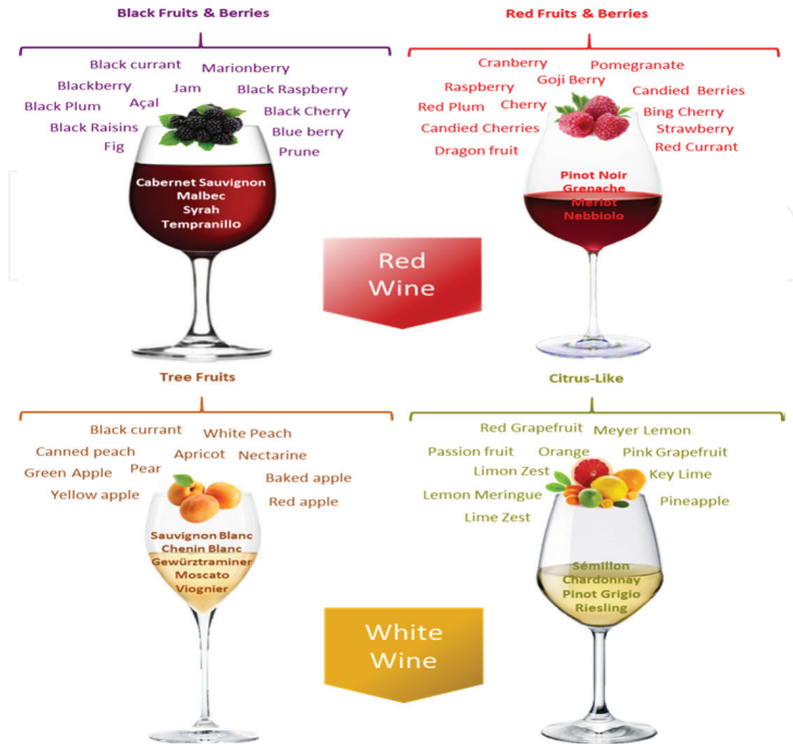
Figure 2. Fruit flavours in the red and white wine.

As already mentioned, the flavour of fruits is a complex set of interactions between two main sensations: taste and aroma [2]. Taste is mainly a set of sweet and sour sensations linked to the presence of sugars and organic acids (although other minor compounds affect bitterness, astringency or saltiness). However, the aroma is usually the predominant sensation, surpassing taste [98]. Indeed, if taste sensations, detected in mouth, are recognised by six classes of receptors (sweet, sour, salty, bitter, umami and fat-taste), for flavour complexity, where the olfactory system is essential, 350 olfactory receptor genes are known in humans [1].