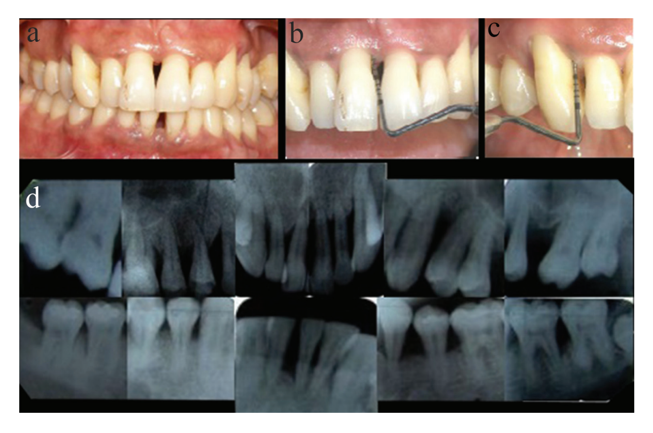
Figure 2. GAgP patient; (a) clinical view of the GAgP patient, (b, c) increased probing depth around the teeth, (d) radiographic view of the GAgP patient.