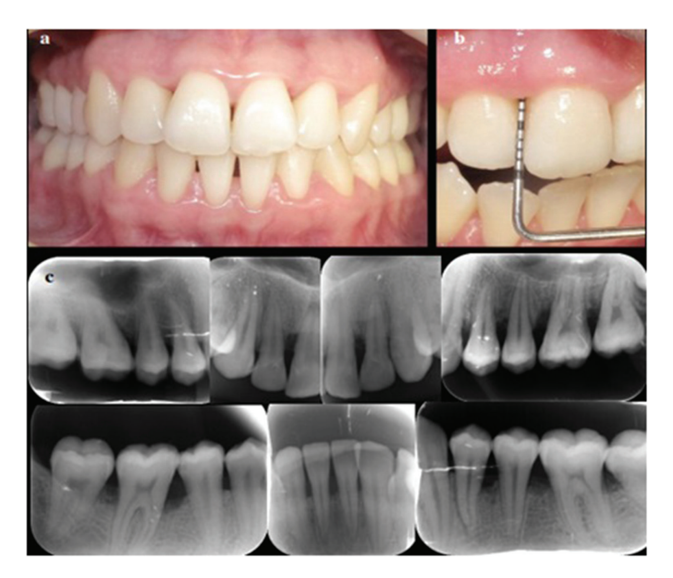
Figure 1. LAgP patient; (a)-clinical view of the LAgP patient, (b) 7 mm probing depth at distal of the incisor tooth, (c) radiographic view of the LAgP patient.