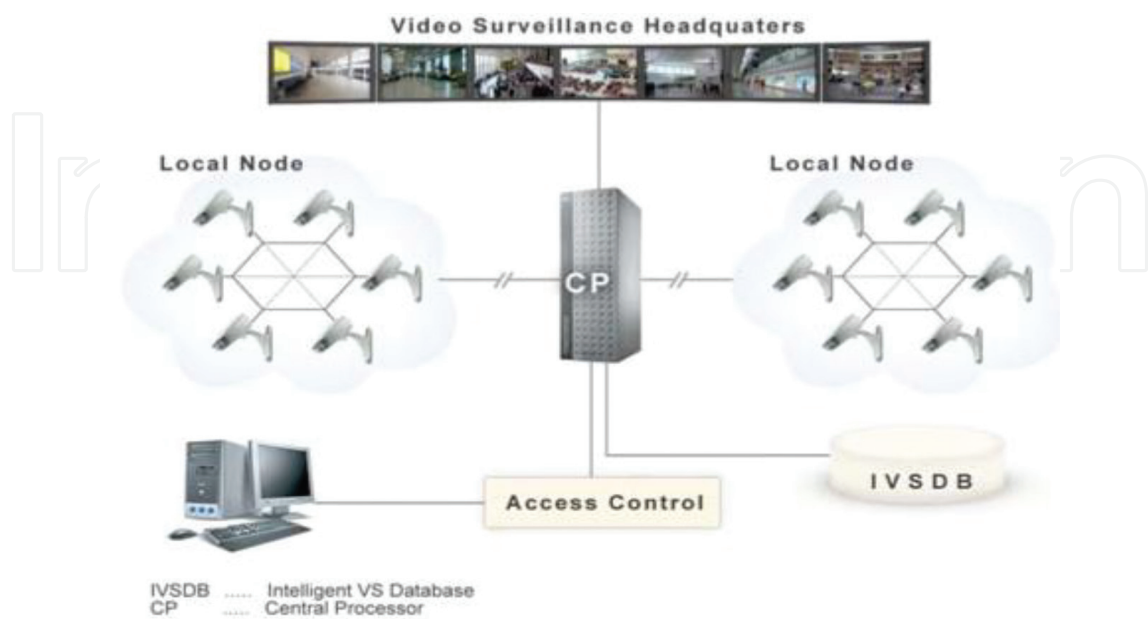
Figure 1. The distributed architecture of the advanced intelligent video surveillance system.

Apart from the hardware (H/W) and software (S/W) which are considered as performance improvisers and the architecture of inter-operational processing, the performance of the