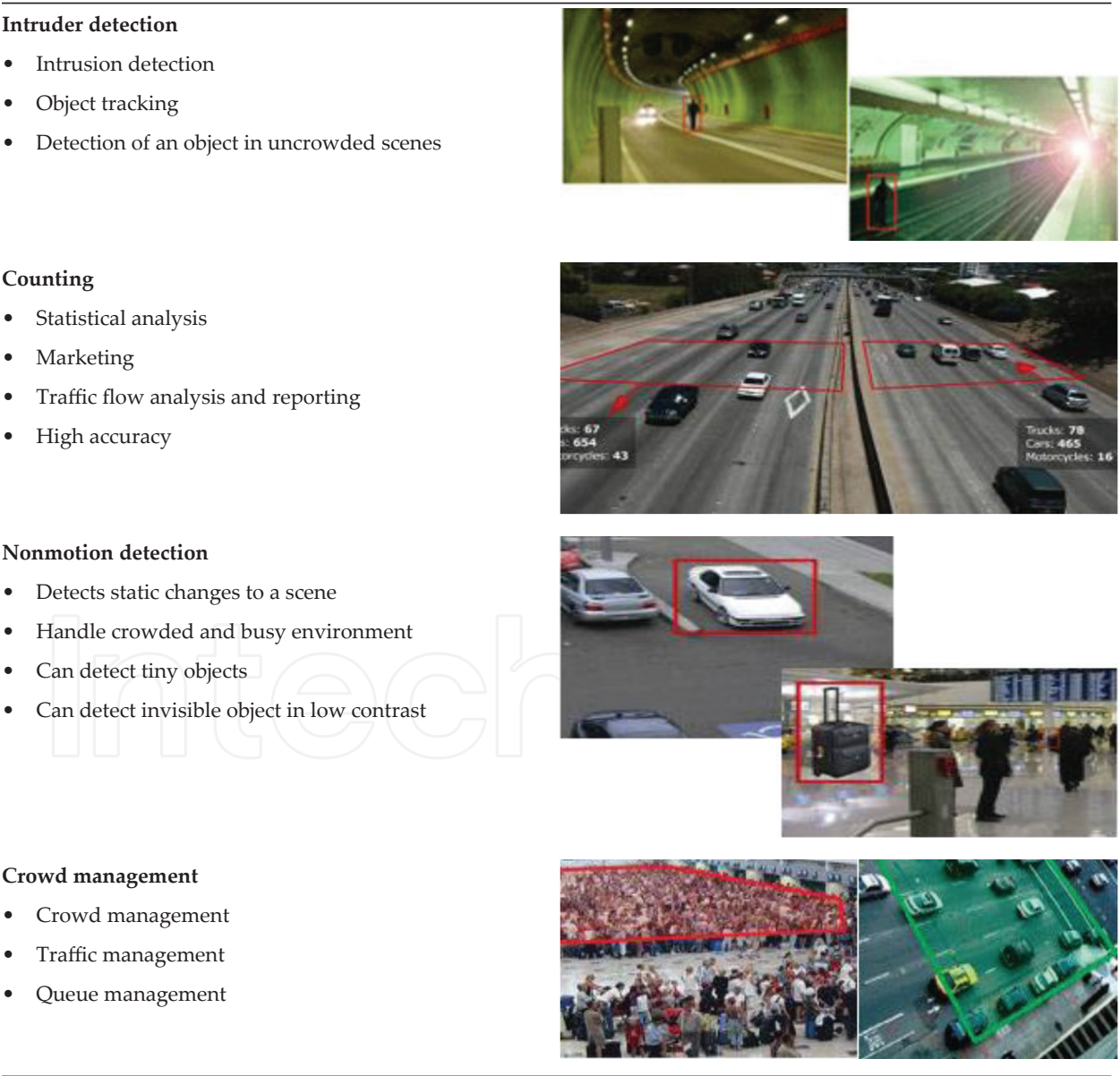
Table 1. Different application areas of video surveillance system.

Amid no light conditions, it is not conceivable to see anything, yet to security cameras, they are barely exceptional, some high fragile security cameras can get clear monochrome images