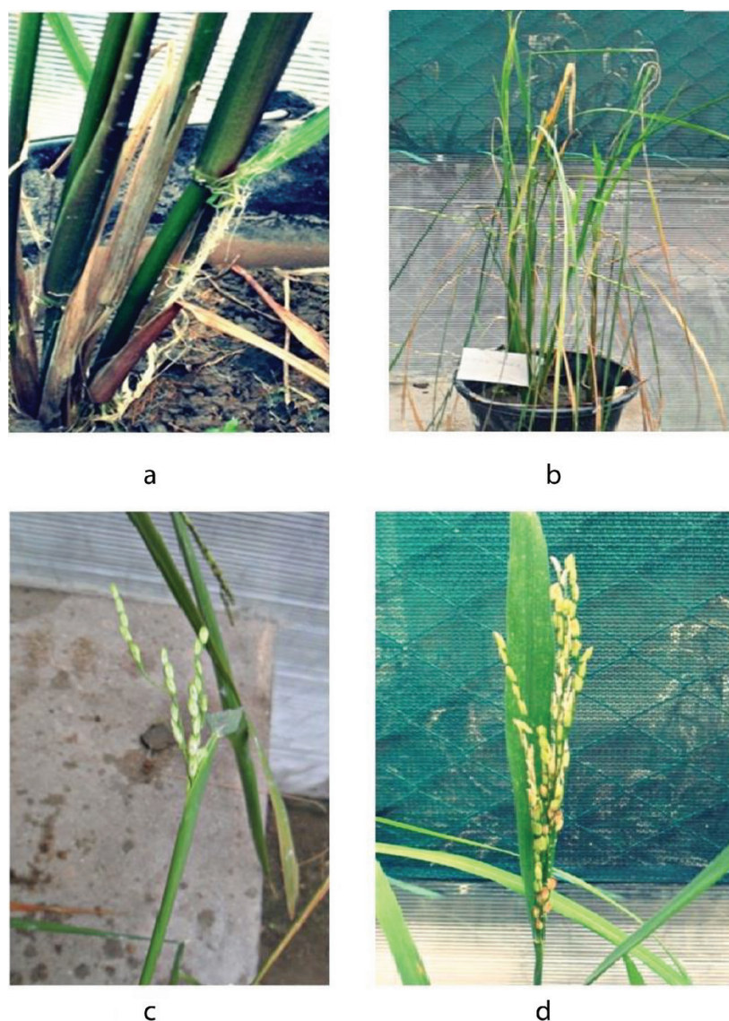
Figure 3. Visual injuries caused by glyphosate: (A) multiple shoots and roots that sprouted from the internodes, (B) leaf curling and discoloration, (C) fused panicle to flag leaf, and (D) bleached lemma and Palea.

to the fusion of the flag leaf at the maturity stage. Malformation of inflorescence and developing grains with only bleached lemma and palea were commonly found in Bg366 ( Figure 3D ). In the variety Bg379-2, distorted and crescent-shape spikelet were observed.