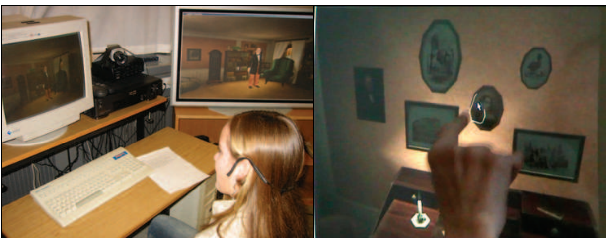
Fig. 4. ( left ) A child interacting with the system; ( right ) hand gesturing on a touch sensitive screen to operate a virtual object within HCA's study.

All pupils were Danish native speakers with advanced skills in speaking English. Fifty-three percent of them (100 percent of males and 43 percent of females) declared themselves as being a frequent (i.e. more than 1 hour/week) videogame and/or console player, with a peak of 45 hours/week spent in gaming by a male teenager. 38.5 percent of the participants (28.6 percent of females and 50 percent of males) had been exposed before to computing systems able to process speech and/or gesture; all of them were acquainted with an earlier version of our system. When asked about their favorite games, children said that they like to play with games of any genre, ranging from shoot-'em-up (66.6 percent of males and 0 percent of females), action, platform, to sports and strategy games (40 percent of males and 50 percent of females). With regard to pre-interaction knowledge about the writer, his life, his fairy tales and the historical period he lived in, 53.8 percent of the children (42.8 percent of females and 66.7 percent of males) declared to have a fair to very good knowledge of these historical and literacy facts and events. Despite surprising at first, this high level of knowledge is due to the fact that Odense is Hans Christian Andersen's hometown. In local schools he is often subject of discussion and several cultural events organized by the Odense municipality are often related to its world-renowned citizen.