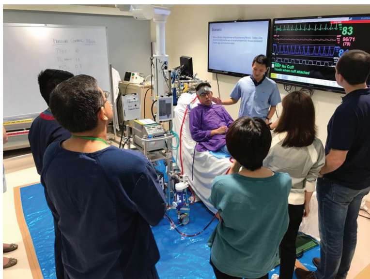
Figure 1. Basic setup of a high-fidelity ECMO simulation environment. A confederate (dressed in blue scrubs) participated in this scenario (adopted from Asia-Pacific Adult ECMO Course, Queen Mary Hospital).