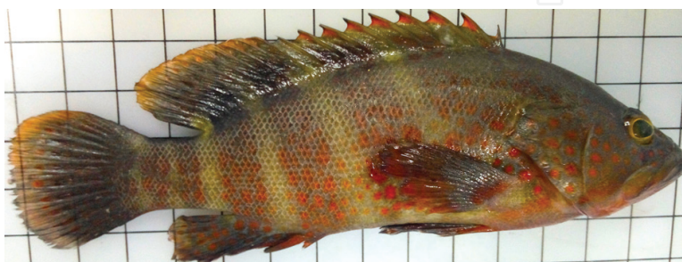
Figure 5. Photo of the alien Niger Hind, Cephalopholis nigri (Perciformes: Serranidae), from Maltese coastal water [58].