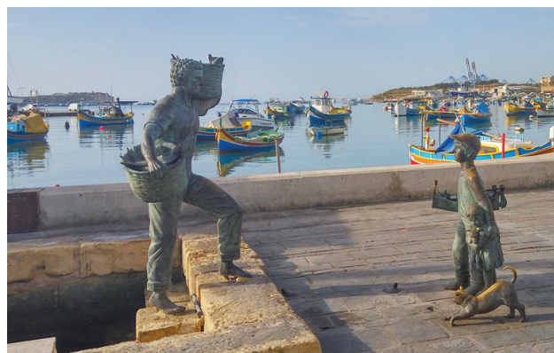
Figure 2. Photo of bronze sculpture at Marsaxlokk fishing village (Malta) with artisanal fishing boats in the background. Promoting the fishing tradition and heritage of this village.

that same sea, which provides for the whole family, generation after generation. This intimate relationship with the sea as provider of goods in the long-term is being lost with the loss of fishing traditions, communities and villages.