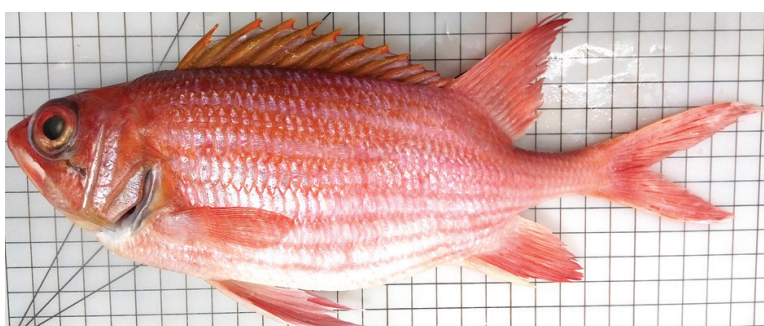
Figure 4. Photo of the Squirrel fish, Holocentrus adscensionis (Osbeck, 1765) (Beryciformes: Holocentridae), first record of its presence in the Mediterranean Sea [59]. This species is a subtropical reef-associated fish native to the Atlantic Ocean and may therefore compete with native Mediterranean reef species.

Among the various alien reef species caught in shallow Maltese waters and identified genetically as well as morphologically one finds: the Cocoa damselfish, Stegastes variabilis ; the Dory snapper, Lutjanus fulvivflamma ; the African sergeant, Abudefduf hoefleri ; the Indopacific sergeant, Abudefduf vaigiensis (Quoy and Gaimard, 1825) [56]; the Lowfin chub, Kyphosus vaigiensis (Quoy and Gaimard, 1825) [57]; the African Hind, Cephalopholis taeniops and the Niger Hind, Cephalopholis nigri ; the Squirrelfish, Holocentrus adscensionis (Osbeck, 1765) [59]; and the Monrovia doctorfish, Acanthurus monroviae (Steindachner, 1876) [60]). Figures 4 and 5 show some of the alien species caught in Maltese waters. Table 1 shows the habitat preference of these species and the current status of these species in Maltese waters. Through ongoing research and monitoring it was possible to confirm species establishment while other potentially dangerous and invasive species such as the pufferfish and lionfish species were also spotted [61] posing particular cumulative impacts on fisheries and native reef species. The diversity of invasive species may produce diverse impacts that still need to be understood [8, 9].