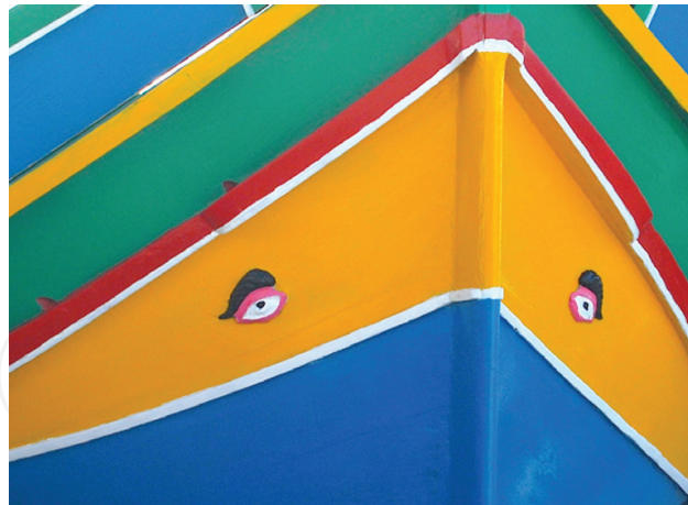
Figure 1. Photo of front of Maltese artisanal boat with the eyes of Osiris thought to protect the fishermen out at sea.