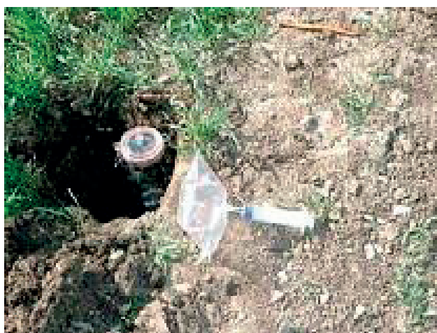
Figure 4. Incubation pot before it was buried and bag and syringe with acetylene.

To determine the N extraction of wheat in the aerial part at harvest, a 0.25 \text{ m}^2 area in each plot was randomly chosen and the plants in that area were cut to the ground. Grain and straw were separated and dried in an oven at 70^\circ\text{C} for 48 h at least to determine biomass. Then, the samples