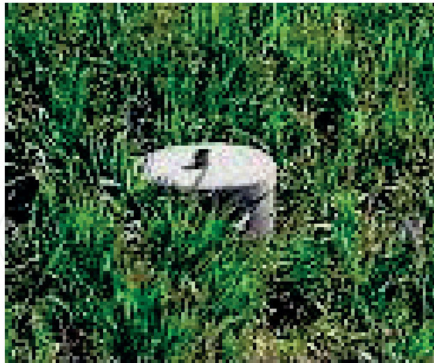
Figure 3. Chamber in the soil.

this period of time, samples were taken every 2 days in treatments 0, 40 + 100, 40 + 60 + 40, and 80 + 140. In the year 2003, more exhaustive measures were taken so as to assess not only the differences in the emissions after N applications but also to study the N_2O emissions of the field after harvest and laboring and to determine the effect of the temperature and humidity on emissions. Therefore, that year, samples were taken every 2 days after N broadcasting and every fortnight from January 20, 2003 to February 4, 2004 in treatments 0, 40 + 100, and 80 + 140. Measurement frequency intensified around laboring time.