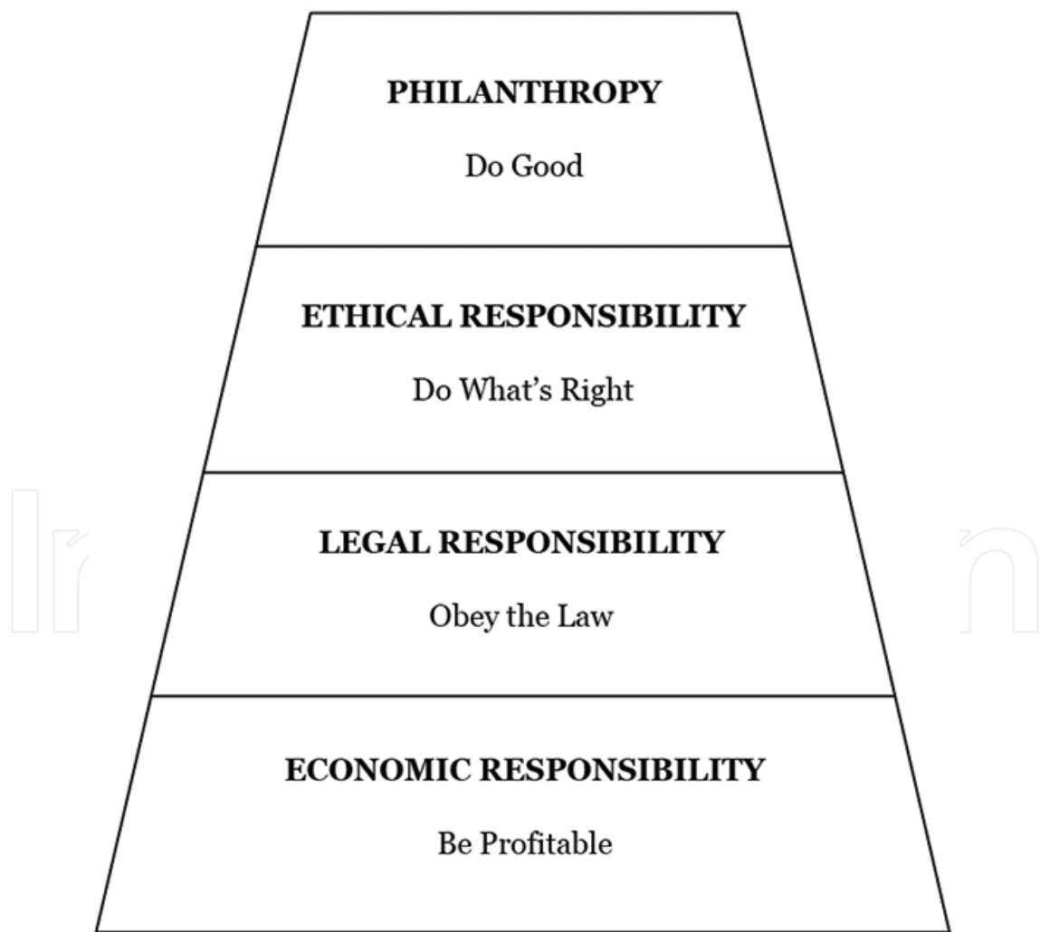
Figure 2. The CSR pyramid illustrates the different levels of corporate responsibility. Source: Carroll (1991).

International business ethics investigates the third level of the Corporate Social Responsibility Pyramid: ethical responsibilities that are desirable or prohibited, but are not necessarily codified in law. Theoretical developments for answering this question were based on the adaptation of traditional ethical theories such as libertarianism, utilitarianism, Kantian deontology and virtue ethics to the new challenges posed by globalization (Figure 2).