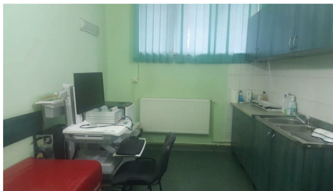
Figure 1. Laboratory for anorectal manometry and biofeedback.

The investigation of the anorectal function in patients with defecation disorders should be carried out in a dedicated room of the laboratory for gastrointestinal motility studies in conditions of