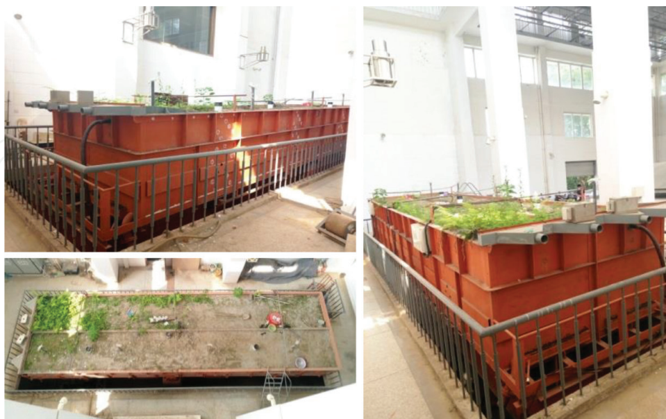
Figure 8. The experimental slope-adjustable soil tank in Hohai university.

The slope-adjustable soil tank is made of welding steel plates splitting into two parts of the main tank and overflow tank in State Key Laboratory of Hydrology-Water Resources and Hydraulic Engineering of Hohai University ( Figure 8 ). The two tanks are connected by four holes at the bottom. Effective volume of main tank measures 12 m long × 3 m wide × 1.5 m deep, while that of overflow tank measures 1.5 m long × 10 m wide × 6.2 m deep. The whole tank is divided into two 1.5-m-wide parts, varying from 0 to 30° under the drive of hydraulic pressure. The decision of its size is optimized profoundly after referencing international