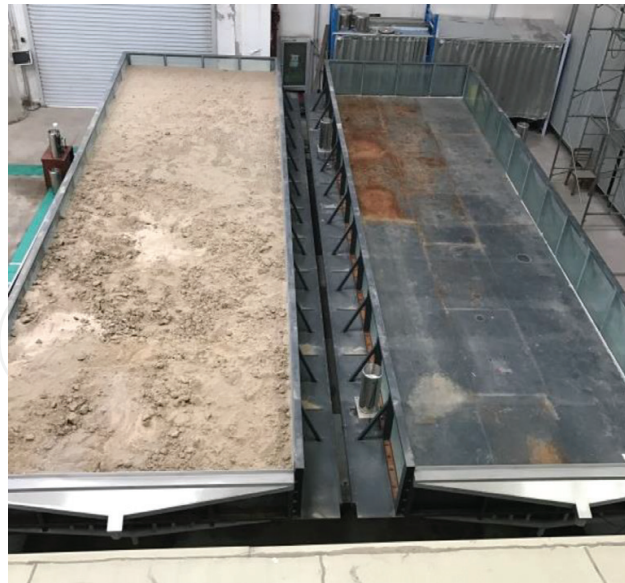
Figure 4. The new experimental sink of runoff and erosion in IGSNRR.

10 m long, 3 m wide, and 0.8 m high, and each one is located under artificial rainfall system. The slope of the experimental sink could be adjusted automatically from 0 to 35°. One 5 cm hole is cut into the downslope end of each plot. A short metal stub pipe is welded onto the hole to form an outlet. Two water flow monitors are horizontally set up in front of each box for the measurement of the runoff. For simulated rainfalls, runoff volume measurements and sediment sample collection are performed every 5 s and 5 min, respectively.