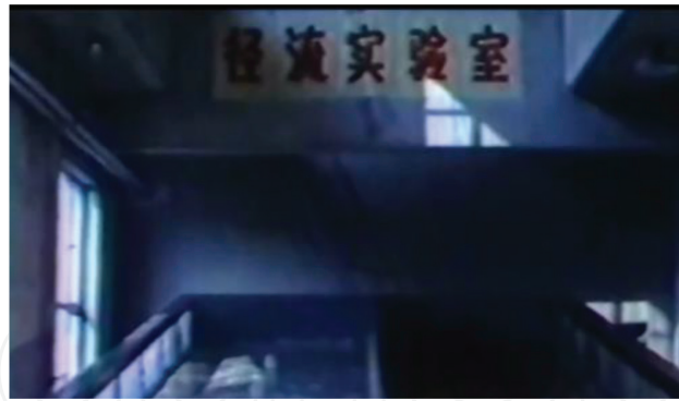
Figure 2. Runoff laboratory of Institute of Geography, Chinese Academy of Sciences.