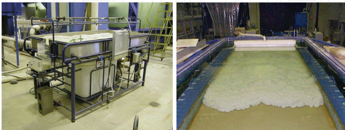
Figure 1. The margins tank of Ven Te chow Hydrosystems lab.

An experimental variant slope soil tank was installed in the runoff laboratory of Institute of Geography Chinese Academy of Sciences in 1965 ([3]; Figures 2 and 3 ). It was the first device in China that was used for study the rainfall-runoff and soil water movement. The tank was 8.0 m long, 3.0 m wide, and 1.0 m deep, with drainage holes at the surface and bottom to facilitate water discharge. The slope gradient ranges from 0 to 30°. A runoff collector was installed at the bottom of the soil tank, which was used for collecting runoff samples during the experimental