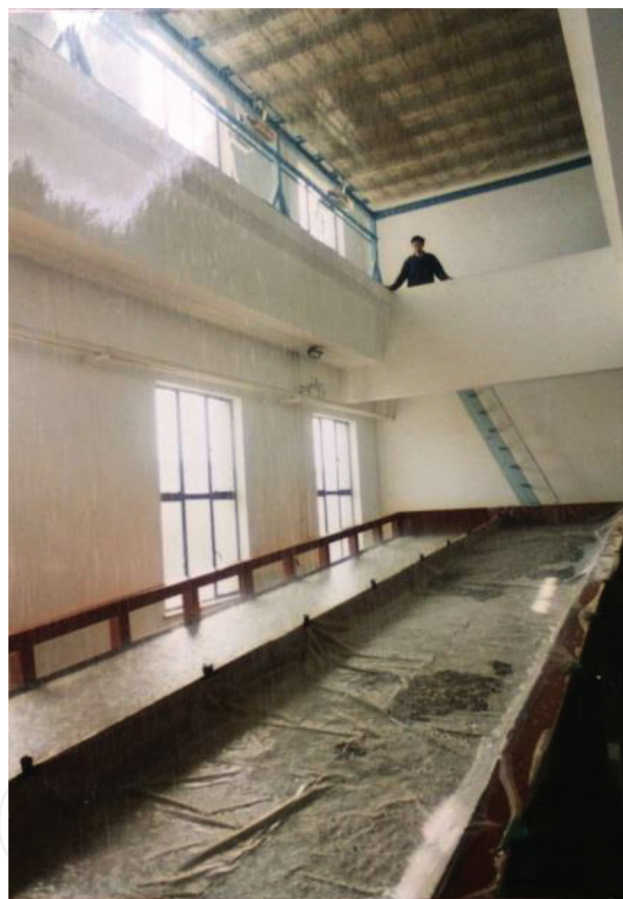
Figure 3. The experimental variant slope soil tank in the runoff laboratory of Institute of Geography.

process. A rainfall simulator system was used to apply rainfall. This rainfall simulator can be set to any selected rainfall intensity ranging from 0.3 to 3.0 mm/min by adjusting the nozzle size and water pressure. The fall height of raindrops was set at 16 m above the ground, which allows all the raindrops to reach terminal velocity prior to impact with the soil surface.