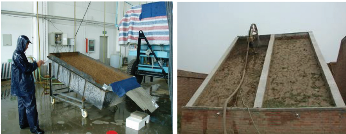
Figure 7. The experimental variant slope soil tank in Beijing Normal University.

The artificial rainfall simulation testing ground is approximately 300 m 2 , concluding 15 trough rainfall simulators, which have various combinations of types of sprayer, water pressure, and rainfall intensity. Every trough rainfall simulator has three swayed sprinklers, spacing at 1.1 m, installed with the height of 5.2 m [9, 10].