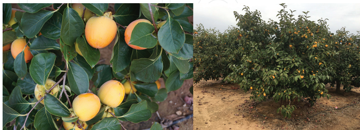
Figure 1. Fruits and tree of 'Rojo Brillante' cultivar.

'Fuyu', 'Hana Fuyu' and 'Ichikikei Jiro' cultivars which are PCNA and 'Hachiya' (PCA) are commonly produced in the USA [10, 18]. In new persimmon growing countries such as New Zealand and Australia, most of the cultivation area is devoted to 'Fuyu' [27]. In Spain, the most produced cultivars are 'Rojo Brillante' (Figure 1) and 'Triumph' which can be stored for