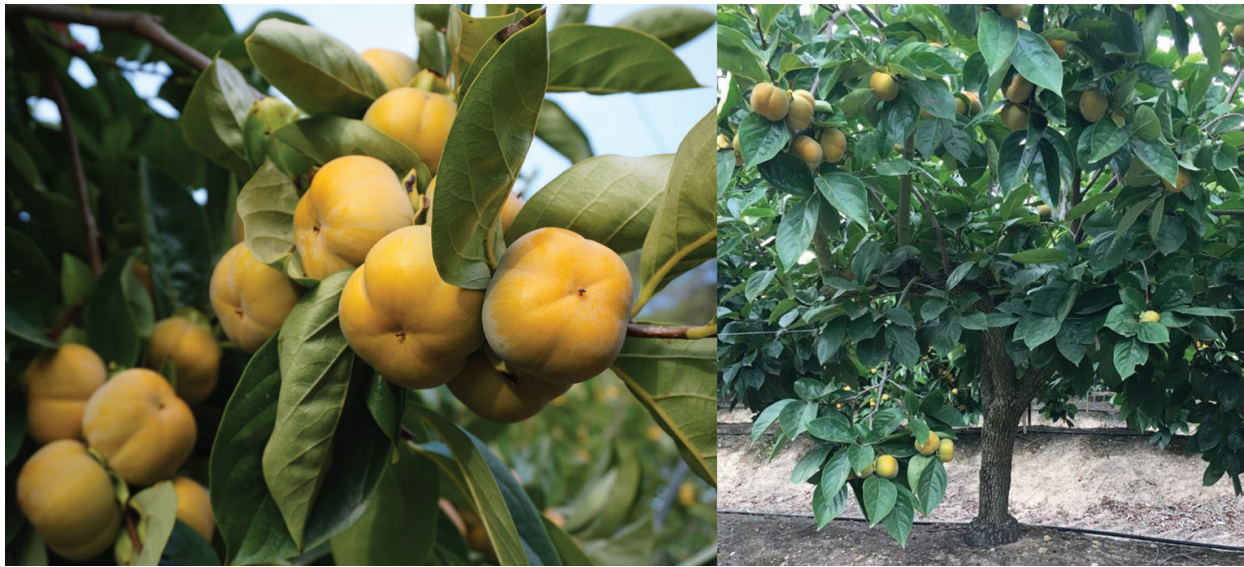
Figure 2. Fruits and tree of 'Triumph' cultivar.

a long time [28]. In Italy, almost 90% of the persimmon production is Kaki Tipo (PVNA), the rest of production is other PVNA varieties (Vainiglia, Mercatelli and Moro) and PCNA cultivars such as Hana Fuyu, Jiro and Gosho [29].