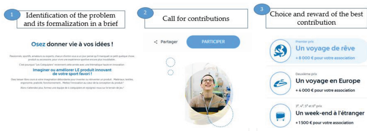
Figure 2. Example of the main organizational stages of creative crowdsourcing.

While presenting the different benefits and risks, the authors include citations of interviewed managers and participants to face scientific arguments to real-life observations.