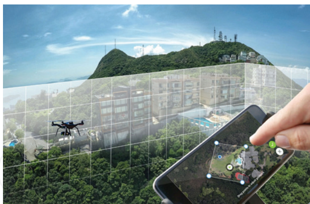
Figure 2. Automatic flying in predefined situations.

Aviation 4.0, using the potential of automatic flying in predefined situations, as illustrated in Figure 2 , and in a rule-based way, could help to overcome today's safety and security gaps, although key R&D work (Aviation 4.0 Research Agenda) is still needed to get it done, such as the: