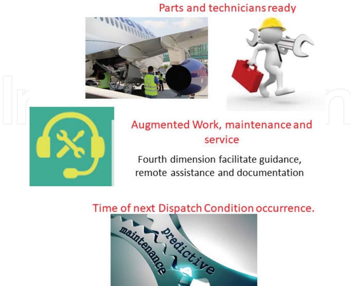
Figure 3. Predictive and augmented maintenance.

like Google Glasses have the potential to recreate complex diagrams and technical information in a 3D-augmented reality environment that boosts the perception of the technicians about the problem and its possible solutions. Maintenance teams might benefit from augmented work technologies to enhance the maintenance and service. An enriched troubleshooting environment with an integrated view of all necessary maintenance information pertinent to the problem might become a fourth dimension that enables remote assistance and guidance as well as real-time access to the most complete documentation while on the job. Predictive and augmented maintenance applications are illustrated in Figure 3 .