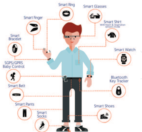
Figure 6. Real-time human performance monitoring and alerting based on nonintrusive physiological sensors/signals and contextual information.

EasyJet: uniform with embedded sensors to track the health, movement and status of crew members.