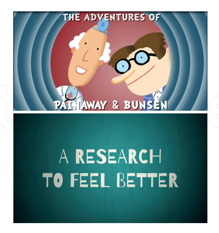
Figure 2. GAPP projects' video: in the framework of the GAPP project activities, two videos have been developed to inform the child participant on the study objectives and procedures according to two age ranges (for children on the top and for teenagers on the bottom).

In the framework of the GAPP project, aimed to confirm the efficacy and safety of gabapentin in pediatric patients affected by chronic pain with a neuropathic component, three booklets and two videos ( Figure 2 ) have been created to inform the child participant on the study objectives and procedures. Two assent forms have been released to obtain his/her consent to