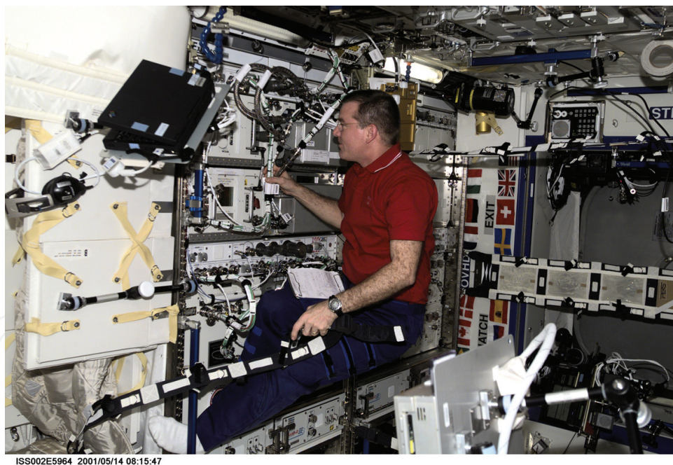
Figure 3. Expedite the Processing of Experiments to the Space Station (EXPRESS) rack 1 on the ISS is pictured on-orbit May 14, 2001, with astronaut James Voss checking ADVASC functioning. The EXPRESS rack is a multipurpose rack system that houses and supports research aboard the space station.

airflow through the arcillite is cut off then oxygen can only reach the roots by diffusion from the air above the soil, or by the arrival of oxygenated water. Diffusion rates are negligible when the diffusion distances are more than a few millimeters [60].