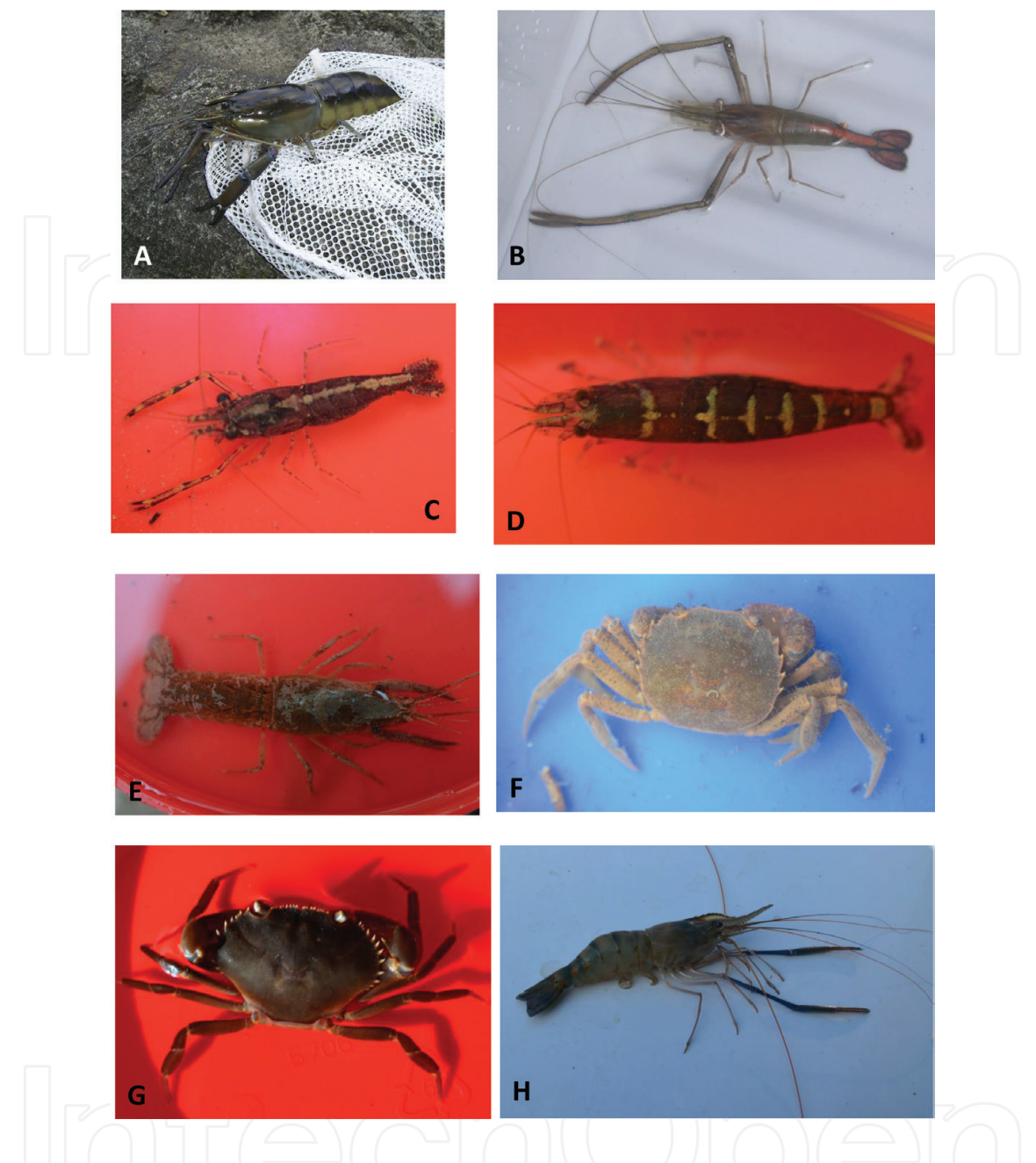
Figure 3. Freshwater decapods species in Guatemala. (A) Macrobrachium carcinus; (B) Macrobrachium acanthurus; (C) Macrobrachium cemai; (D) Potimirim glabra; (E) Procambarus spp.; (F) Trichodactylidae; (G) Pseudothelphusidae; (H) Macrobrachium rosenbergii.