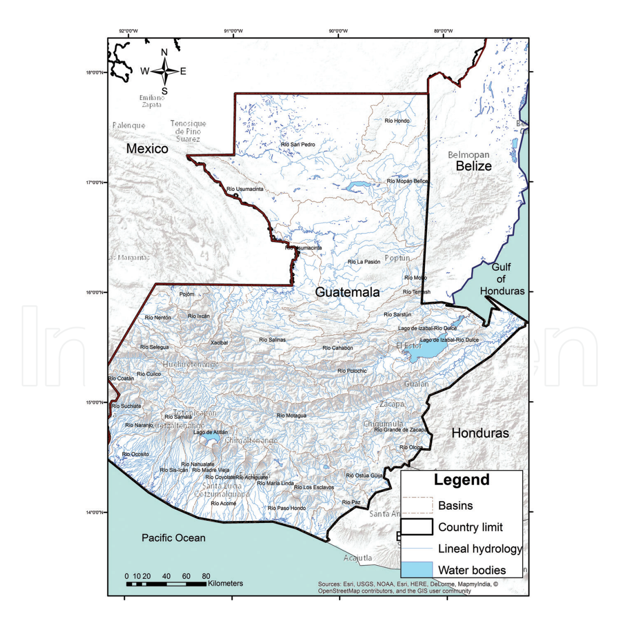
Figure 1. Location of aquatic reservoir in Guatemala (rivers and lakes).

Guatemala as country, has a great biological diversity on the subject of aquatic continental systems. Firstly, as the country is divided into three main slopes, two with drainage on Atlantic Ocean (Gulf of Mexico and Caribbean Sea), both very well defined by bigger basins that occupied all center to north of country [8]. The main river to drainage on Gulf of Mexico is the Usumacinta conformed by important rivers as La Pasión, Chixoy, Salinas e Icbolar, all these rivers with origins on highlands flow through lower lands, which permit to have different physical and chemical water conditions, and producing several habitats that bearing an important biological diversity [9].