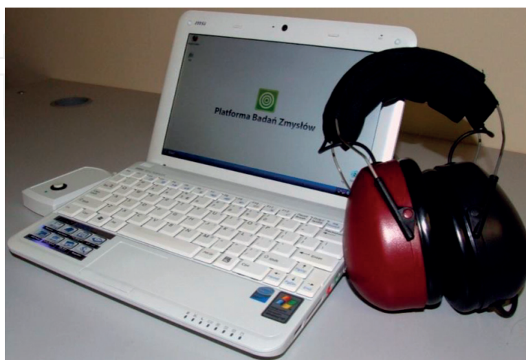
Figure 2. Platform for sense organs examinations.