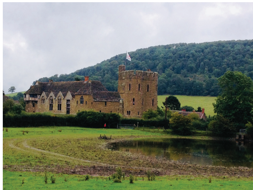
Figure 1. A photograph of Stokesay Castle where EBLV-2 infected bats have been repeatedly detected. The site offers a number of features attractive to bats including the main tower where bats were roosting, a large pond in the foreground that could provide a feeding site and extensive woodland that would provide alternative roosts.

Field studies in the UK in response to the human case of EBLV-2 in 2002 provided evidence of virus circulation within the Scottish Daubenton's bat population [37]. Seroprevalence levels ranging from 0.05 to 3.8% were detected in colonies from across the country although oral swabs taken coincident with blood samples were all negative for EBLV-2. Subsequent surveillance in Daubenton's bat colonies in England found similar seroprevalence levels [38] suggesting that the virus affects bat populations across the country. This is supported by population genetic analysis of English Daubenton's bats [22] and the detection of EBLV-2 infected bats from locations across England, Scotland and Wales [39]. One location where EBLV-2 infected bats have been repeatedly detected is Stokesay Castle in Shropshire [40]. The tower of the castle ( Figure 1 ) is known to host a summer maternity roost and there have been three bats found in the castle that have been infected with EBLV-2. Another infected bat was submitted from the nearby location of Newtown. A further practical question, bearing in mind the zoonotic potential of EBLV-2, was whether current vaccines developed against rabies lyssavirus would be protective against exposure following a bat bite. Cross-neutralisation and cross-protection studies in mice indicated that rabies vaccines would be protective [41].