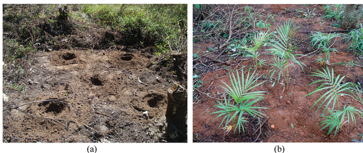
Figure 5. The nucleus of pits for planting and Euterpe edulis Mart. Seedlings planted in an enrichment nucleus. Forest restoration project LARF-UFV.

The planting in nuclei also allows a single crowning for the nucleus as a whole, that is, for the five seedlings, which represents a strong reduction in the costs of implanting and maintaining restoration projects, since the crowning around the seedlings in many regions where herbicide application is not accepted by environmental agencies is the only way to avoid competition with aggressive exotic grasses.