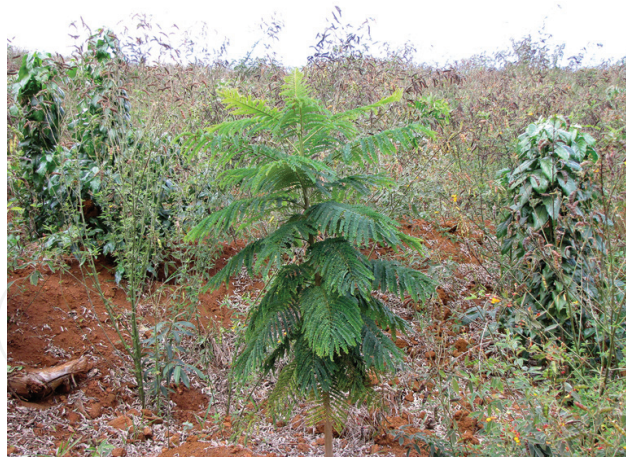
Figure 6. Forest restoration of mined areas with random planting of seedlings and direct sowing of Cajanus cajan (L.) Millsp. Forest restoration project LARF-UFV.

A detailed study on the viability of direct seeding as a forest restoration technique is found in [46]. In it, the authors discuss very satisfactory results of the application of a new mechanized direct seeding methodology adopted in a large scale in the state of Mato Grosso, Brazil, in which seeding agricultural machines were adapted for seed sowing of native species. In addition, they present a review with excellent results of experiments of direct seeding of different species in the Brazilian biomes.