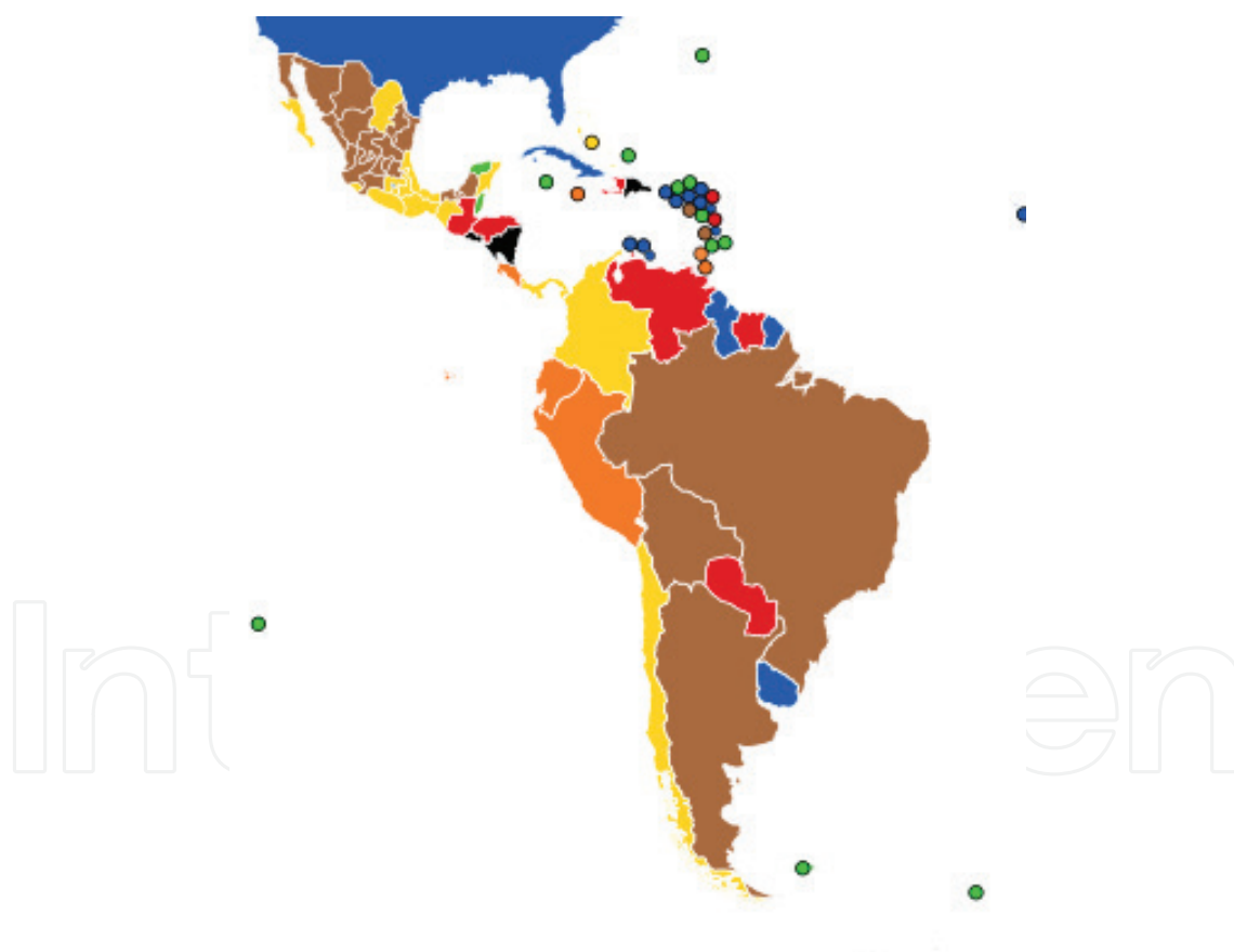
Figure 1. The status of abortion law in Latin America, United Nations 2013 report. In some cases, this map may not accurately depict the content of this article. ■ Legal on request; ■ restricted to cases of maternal life, mental health, health, rape, fetal defects, and/or socioeconomic factors; ■ restricted to cases of maternal life, mental health, health, rape, and/or fetal defects; ■ restricted to cases of maternal life, mental health, health, and/or rape; ■ restricted to cases of maternal life, mental health, and/or health; ■ restricted to cases of maternal life; ■ illegal with no exceptions. After Wikipedia, Abortion Law. Available from: https://en.wikipedia.org/wiki/Abortion_law .

Chile had been included in the list of countries that completely prohibit abortion, with penalties of up to 5 years in prison, until the government lifted the ban in 2017 [11, 12]. In Guyana, abortion is legal in the first 8 weeks of pregnancy, after which it can only be legally performed when it endangers the health of the mother or fetus. The legality of abortion in Mexico is determined by each individual state—in Mexico City, abortion was decriminalized in 2007 only if performed during the first 12 weeks of gestation; however, the rest of Mexico has much stricter regulations [13]. Two countries in Central and South America permit legal abortion