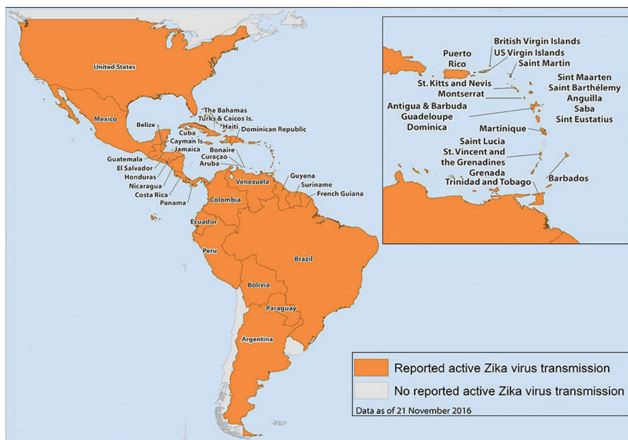
Figure 4. Active Zika virus transmission in the Western Hemisphere up to November 2016. Available from: https://en.wikipedia.org/wiki/2015%E2%80%932016_Zika_virus_epidemic .

incompatible with religious and personal convictions or financially or geographically beyond reach. In addition, facilities in the most Zika-affected regions lack the capacity to respond to the increased demand for family planning [33]. This is due to inadequate infrastructure and delivery systems, insufficient commodities and supplies (including such medications as emergency contraceptives, long-acting reversible contraception, condoms, electric and/or manual and vacuum aspiration (MVA), and mifepristone and misoprostol), as well as a lack of trained personnel to provide quality care to meet the needs of the population. The deficiency in providing adequate contraceptive and safe abortion services, in combination with severely restrictive abortion laws in most countries where Zika was becoming endemic, forced many girls and women to consider, and eventually seek, clandestine and unsafe abortion methods.