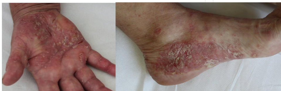
Figure 1. Patient with severe palmoplantar pustular psoriasis induced after 4 weeks of using adalimumab, this severe reaction lead to discontinuation of adalimumab.

The most widespread theory links the relationship between TNF-alpha and type 1 interferon alpha. TNF-alpha inhibits the maturation of plasma dendritic cells that produce IFN-alpha.