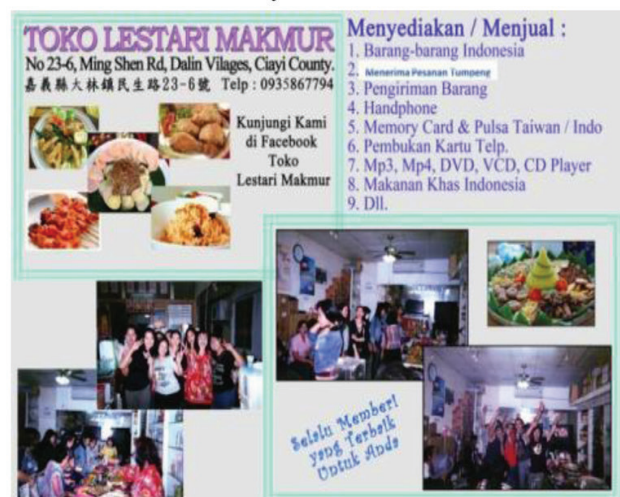
One-stop shopping and relaxation