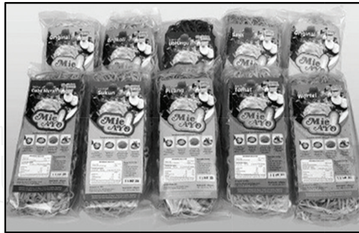
Figure 3. Mie Ayo , one of moca -based noodle product in the market.

institution that actively involved in public service, especially in giving knowledge to people to build community capacity on moca development. The funding by Indonesian government is variety including moca production, moca usage, and the marketing strategies. Java is the most focus island on moca development. Several districts have been setup to be a center for moca production including Trenggalek, Pacitan, Ponorogo, Blitar, Malang, Tulungagung, and Kediri. Those belong to East Java. However, moca also has been developed in Central Java and the Special Region of Yogyakarta. The biggest moca mill is in Trenggalek. The production of moca on industrial scale also spread to outside Indonesia including Malaysia. That country has factory called Malaysian Moca Sdn Bhd which has been operated since 2015 [55] ( Figure 3 ).